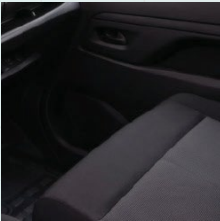
Curtiba Grey (Colour Code 054)