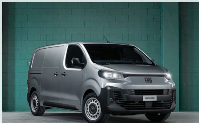
Silver – Metallic (Colour Code 861) Option