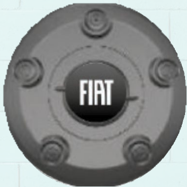
16” grey steel wheels with black half hubcap (Standard on Scudo)