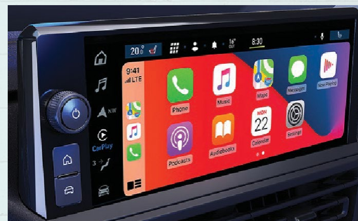
10" Touchscreen Infotainment Display with Apple CarPlay® & Android Auto®