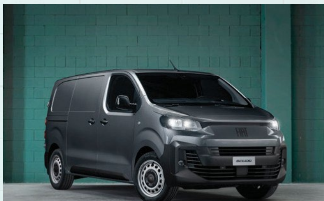
Grey – Metallic (Colour Code 125) Option