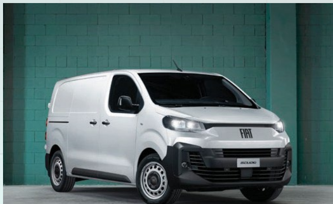
White – Solid (Colour Code 549) Standard