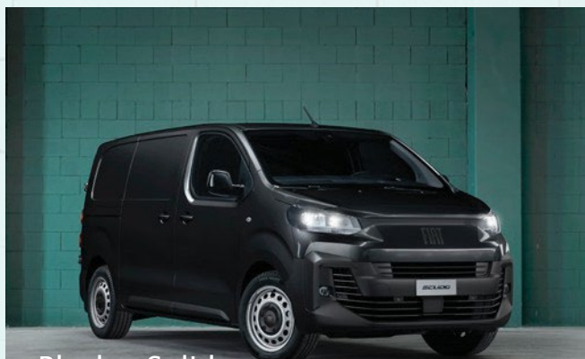
Black – Solid (Colour Code 632) Option