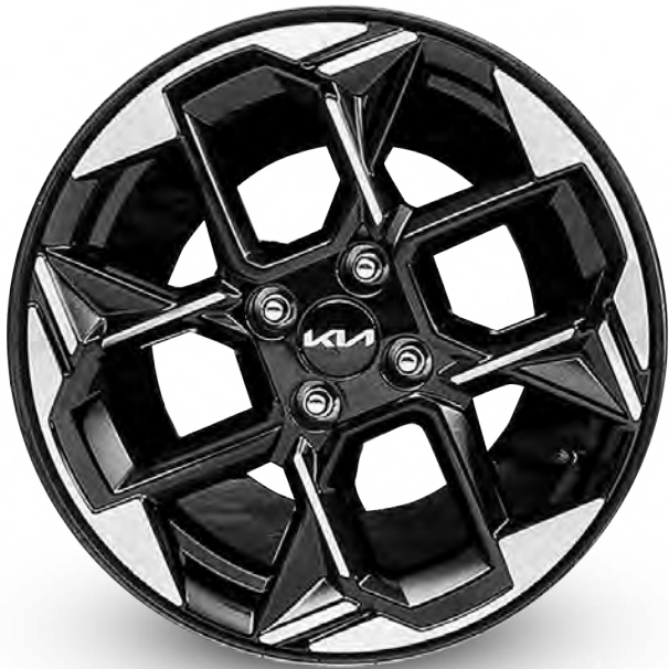
16" alloy (GT-Line)