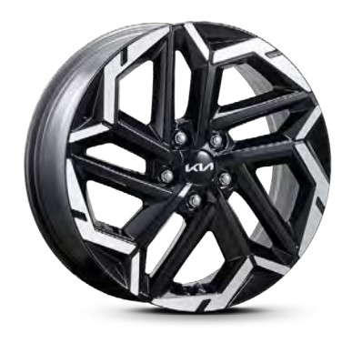
18" Alloy Machine Finished (Deluxe)