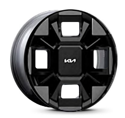
19" Alloy (Water HEV)