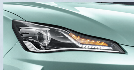
HAWK-EYE LASER headlights