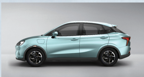
DOLPHIN STREAMLINE low wind resistance