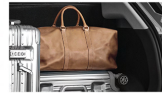
335L-25 boxes volume up to 552L