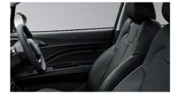
Ergonomic Zero Gravity Seats