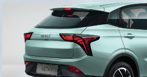
SPORTY REAR BACK with suspended roof