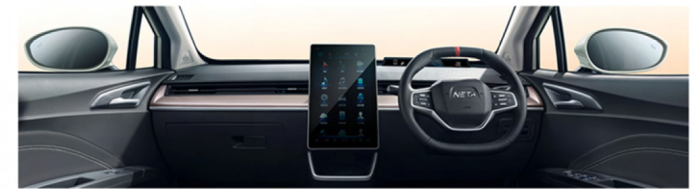
14.6" Infotainment Screen