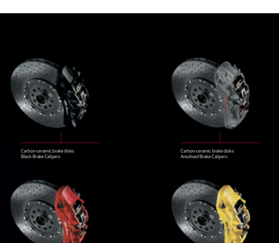
Carbon-ceramic brake disks Red Brake Calipers

Carbon-ceramic brake o Yellow Brake Calipers