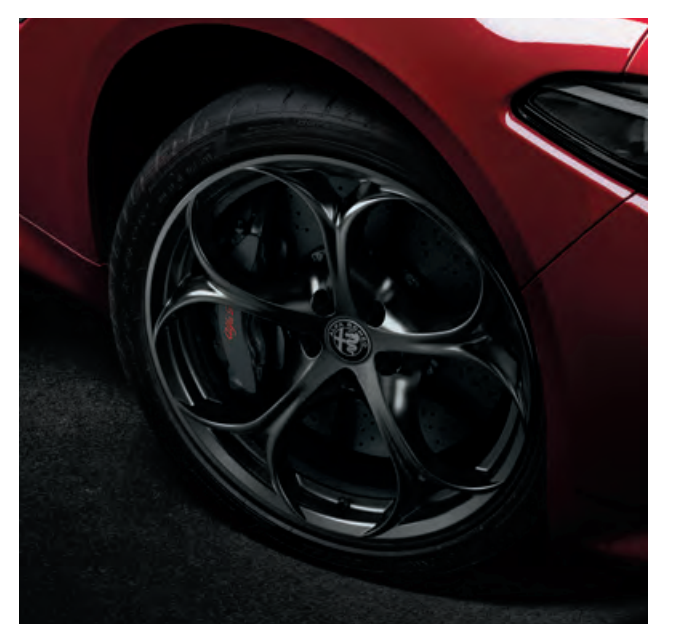
5EQ 19-Inch 5-Hole Dark Finish Alloy Wheel (Standard - Veloce Carbon)

Standard (S) Option (O) Not Available (-)