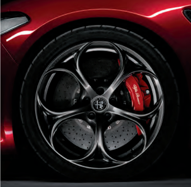
5YN 19-Inch 5-Hole Dark Alloy Wheel (Standard - Quadrifoglio)