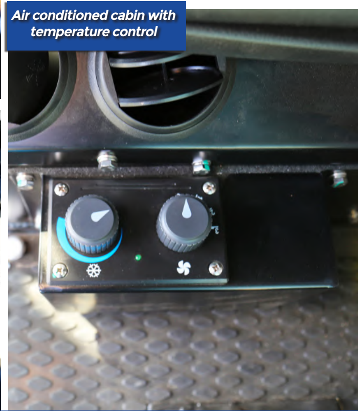
Air conditioned cabin with temperature control