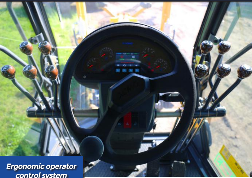
Ergonomic operator control system