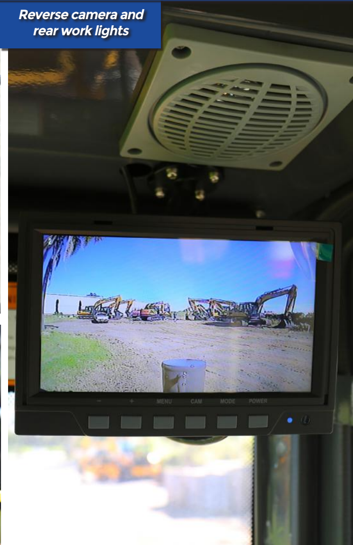
Reverse camera and rear work lights