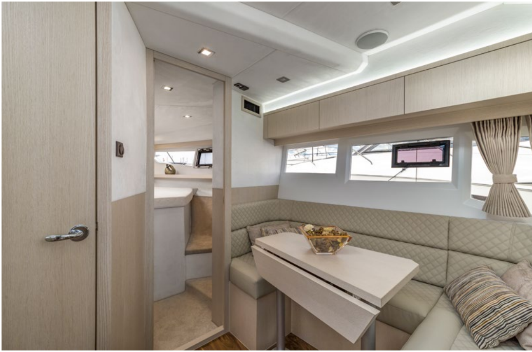
Extend the table or take it out completely to create extra space —