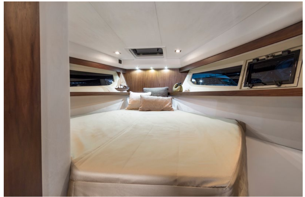
The bow cabin offers a double bed —