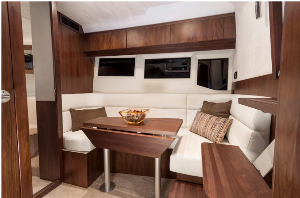
A rest and dining area in the saloon —