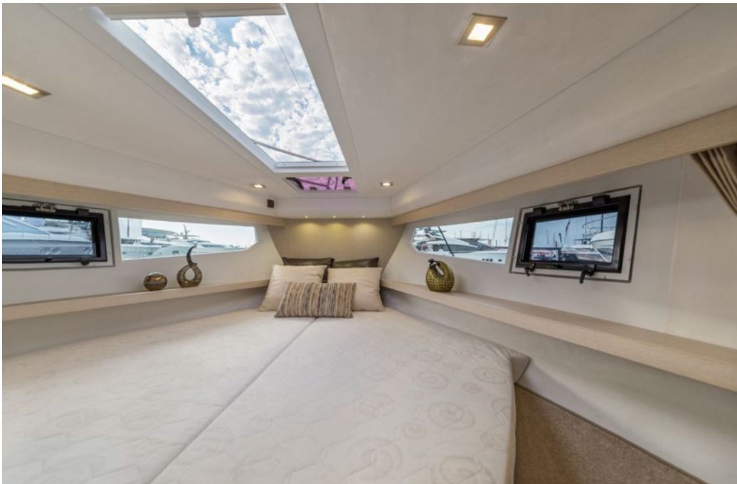
Forward cabin with a magnificent skylight above —