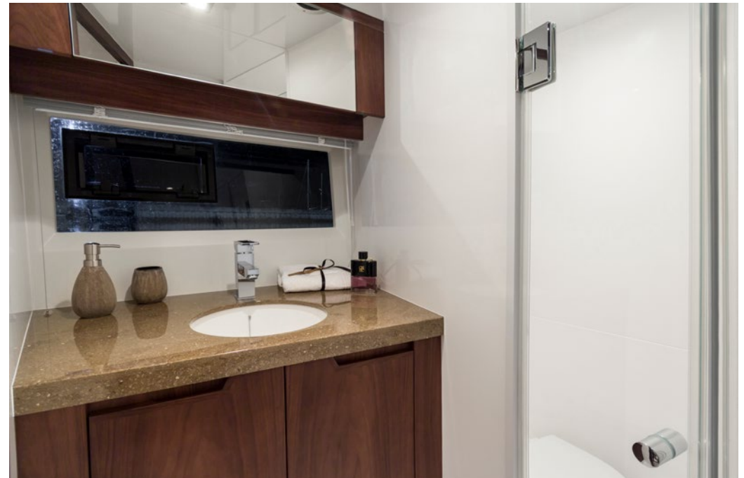
The bathroom holds a head and a shower —