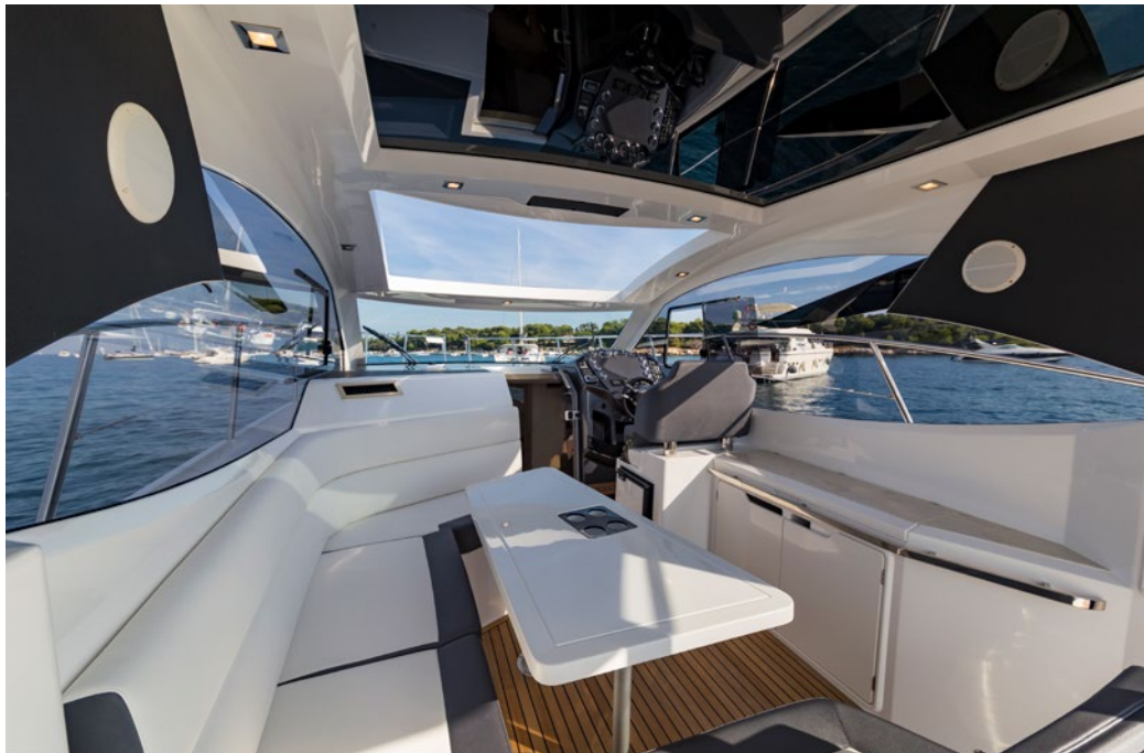
— A wet bar on the main deck