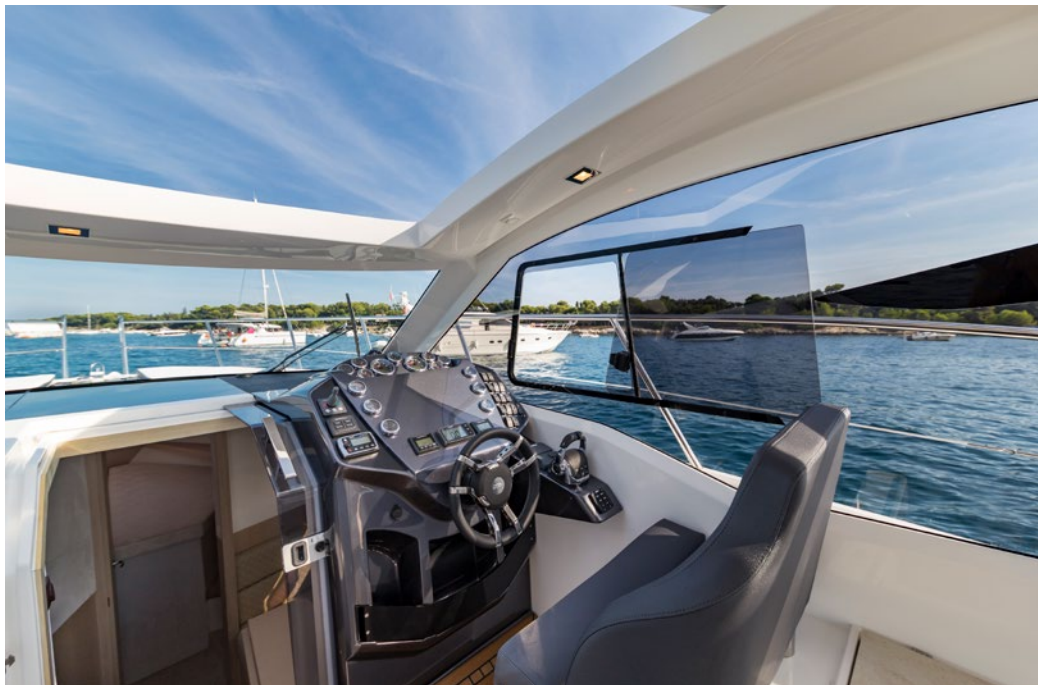
— Open the sunroof and slide the window the let the air in