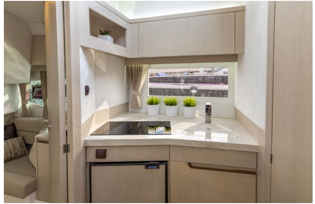
A convenient galley can be found down below —