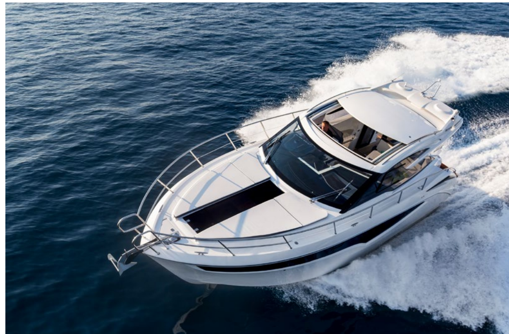
Supreme handling and performance —