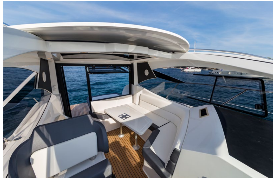
— Great visibility all around