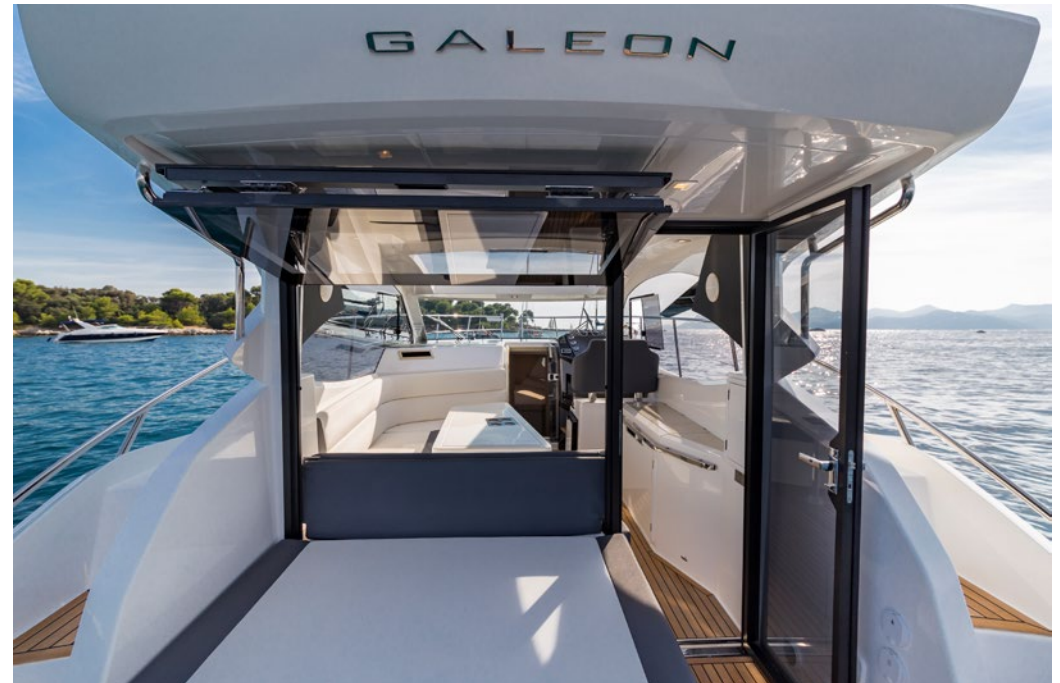
— Closed or open cockpit- you decide!