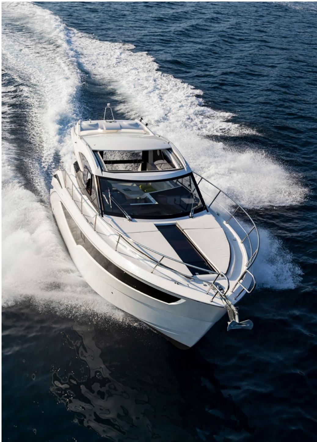
Slide the roof open to let the breeze in —