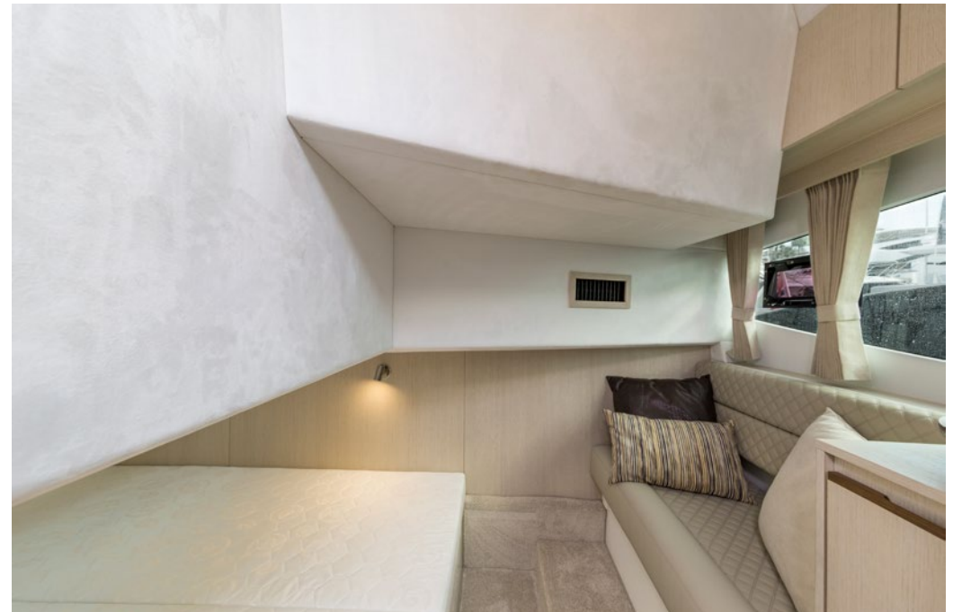
Double bed and a rest area in the guest cabin —