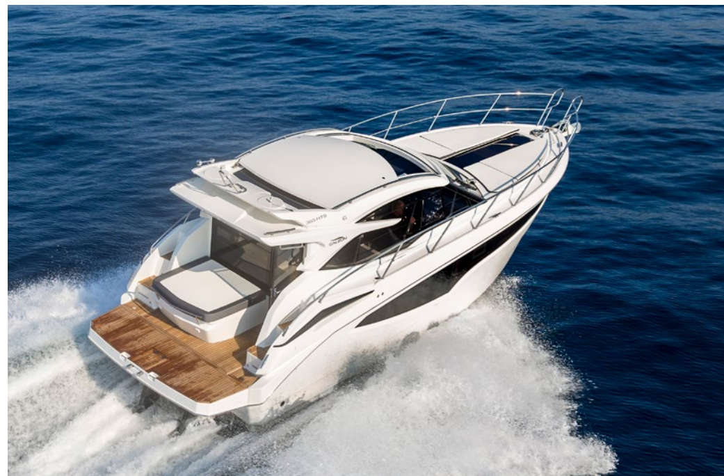
Close the cockpit doors for a quieter ride —