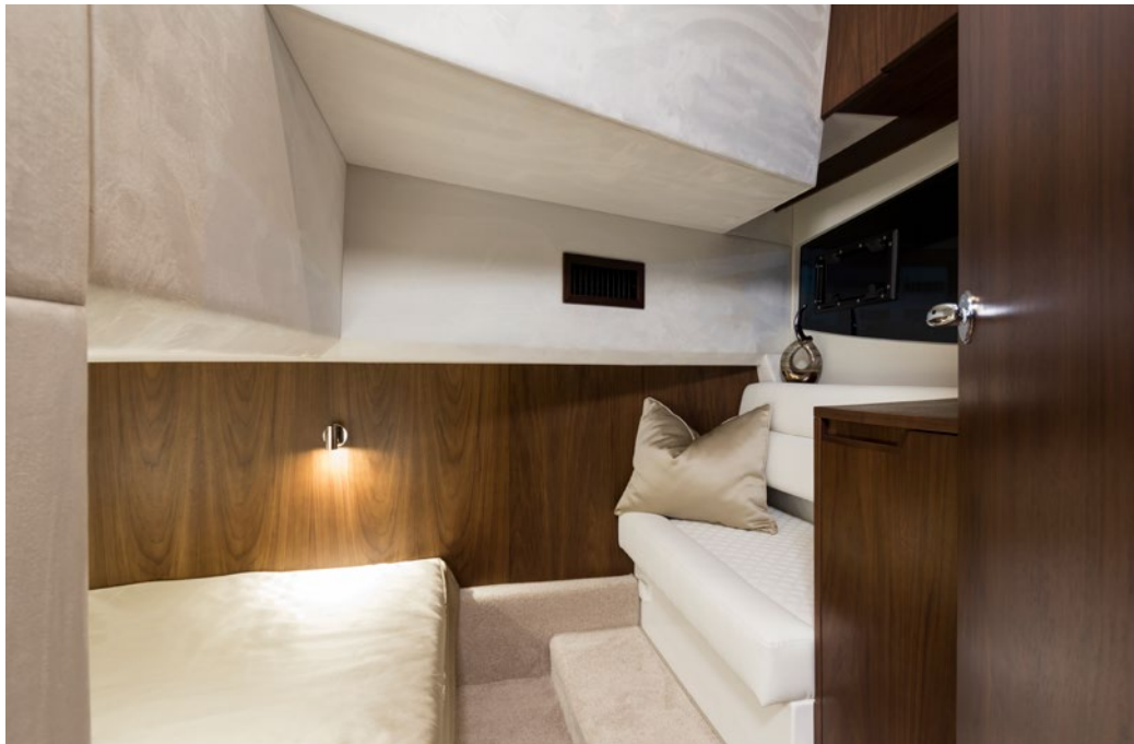
Double bed and a rest area for the guests —