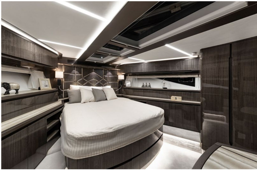
Forward VIP cabin with separate access and private bathroom