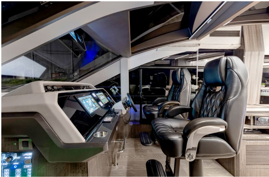
Two sport seats occupy the helm area —