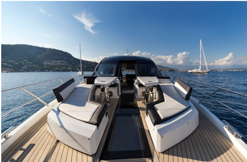
— Plenty of space in the cockpit for all activities on the bow