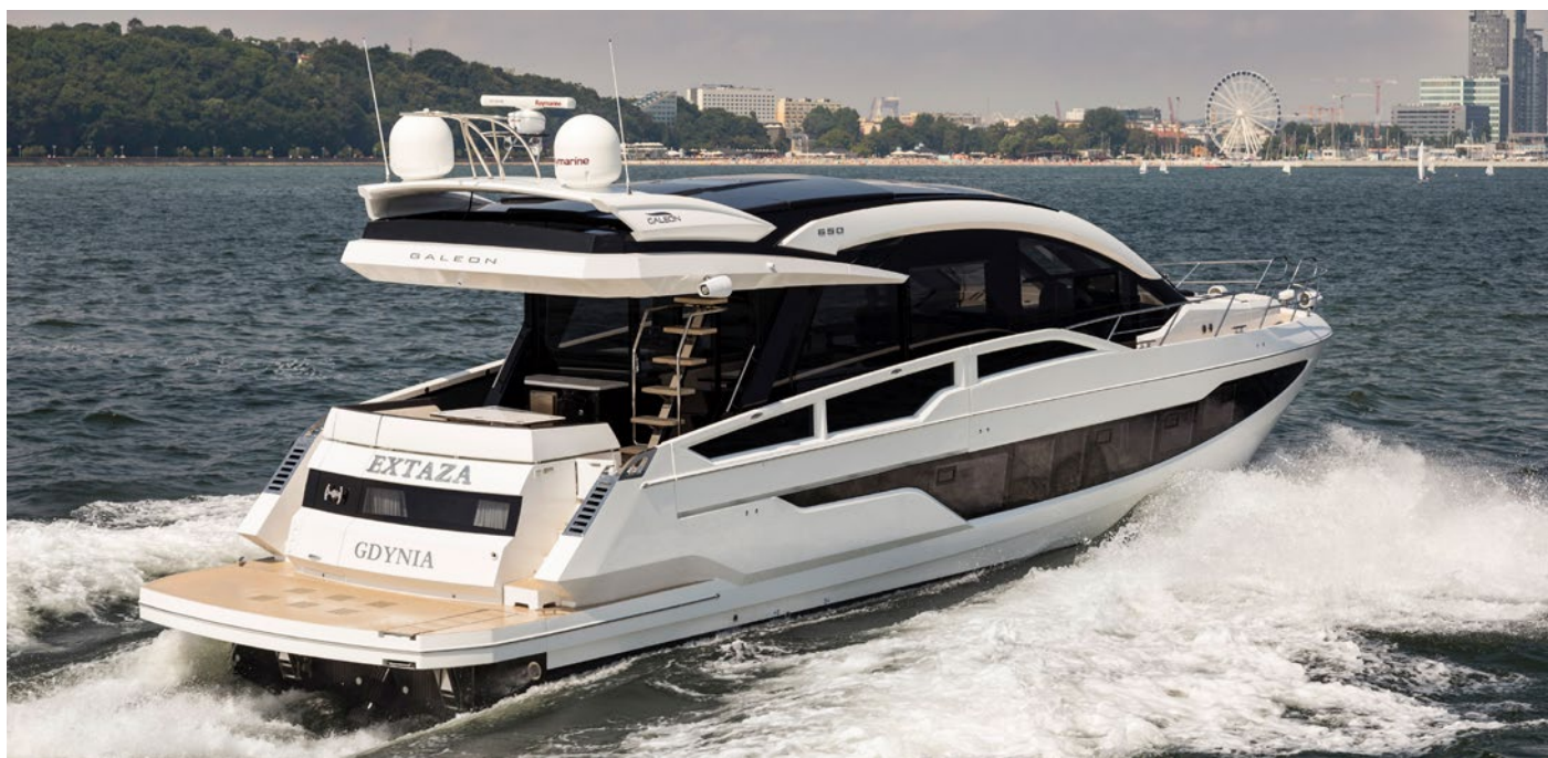
Simply close off the roof and the SKYDECK becomes a hardtop – brilliant!