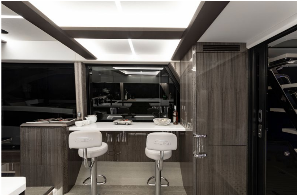
Slide the window and serve drinks to the outside area! —