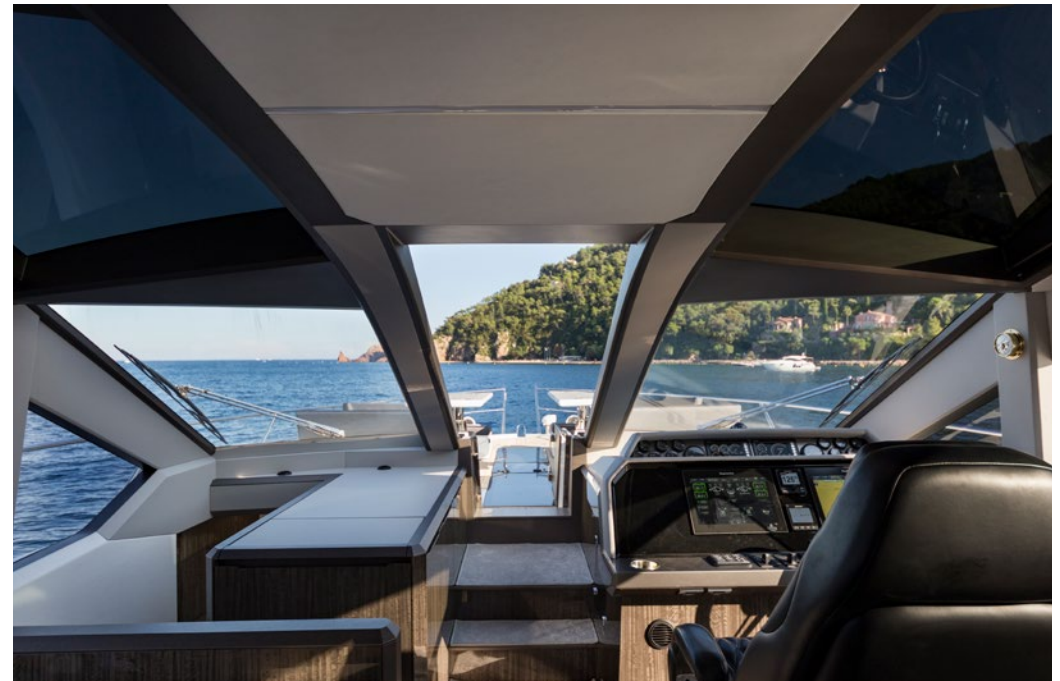
— Retractable windshield system which opens a direct passage from the saloon to the bow space