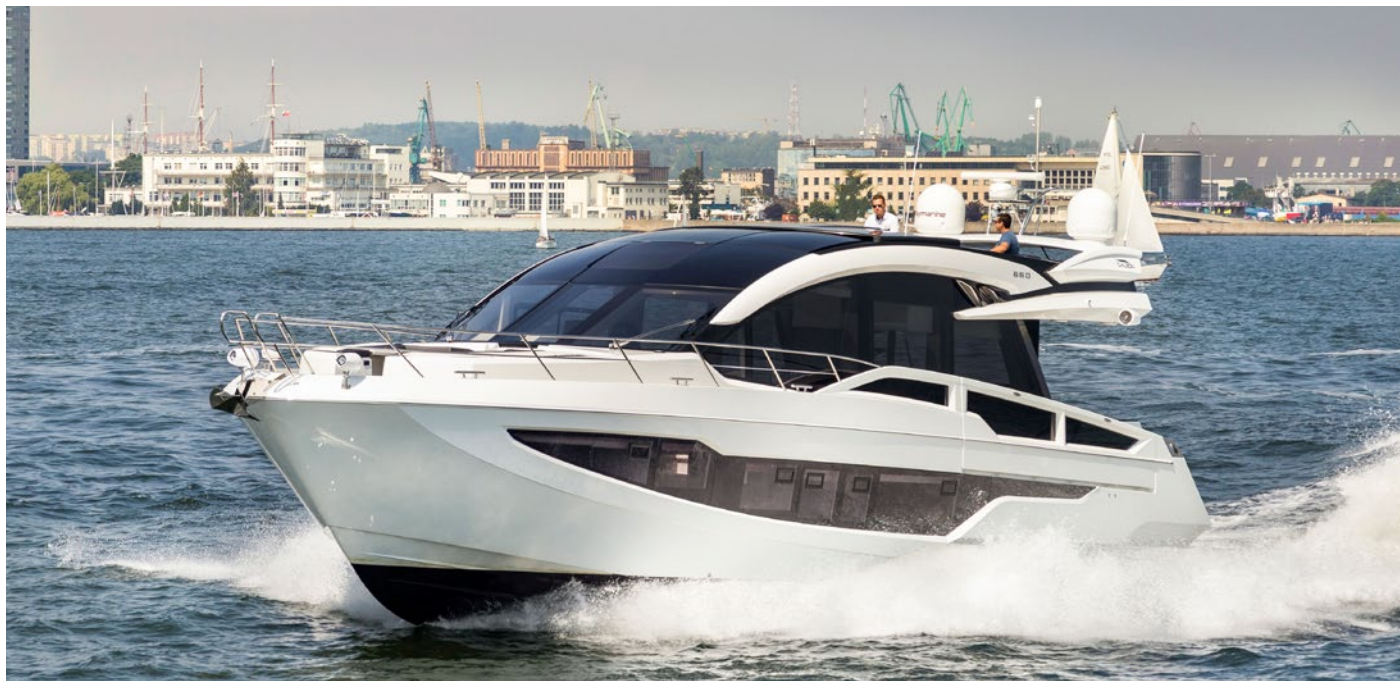
Supreme handling and performance