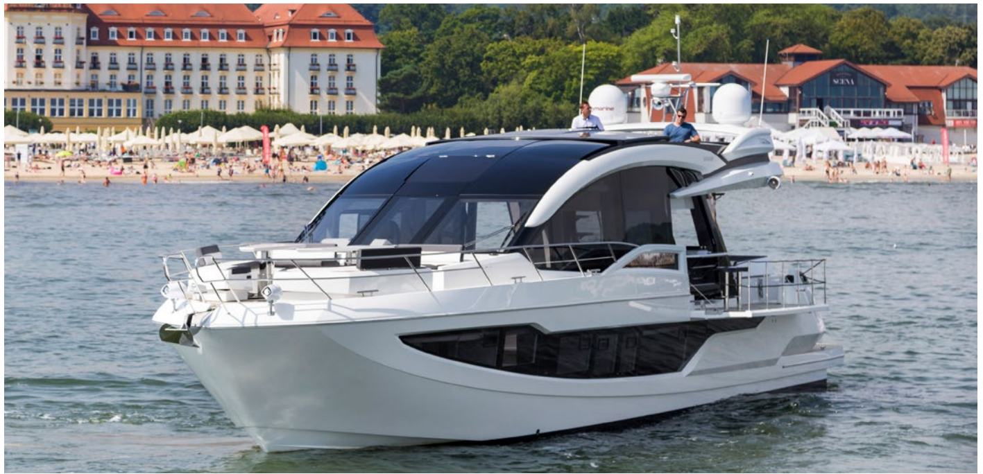
The middle panel of the windscreen retracts providing easy access to the bow