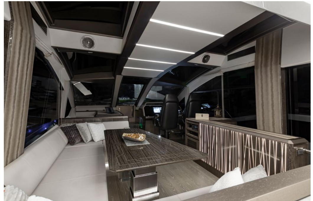
Notice the incredible amount of windows all around —