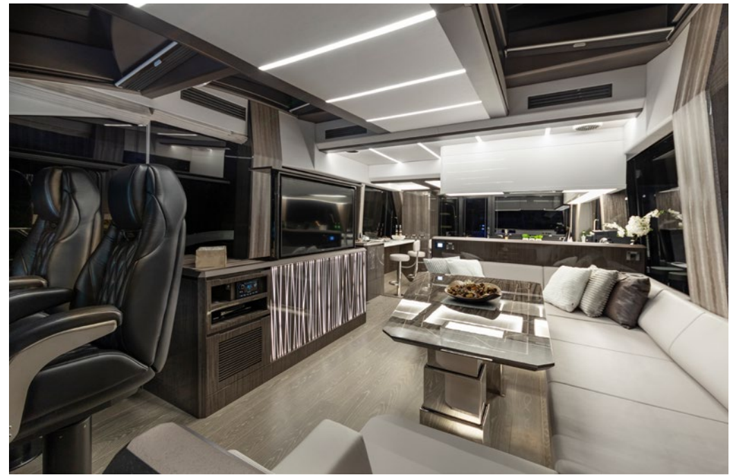
A large TV in front of the entertainment area —