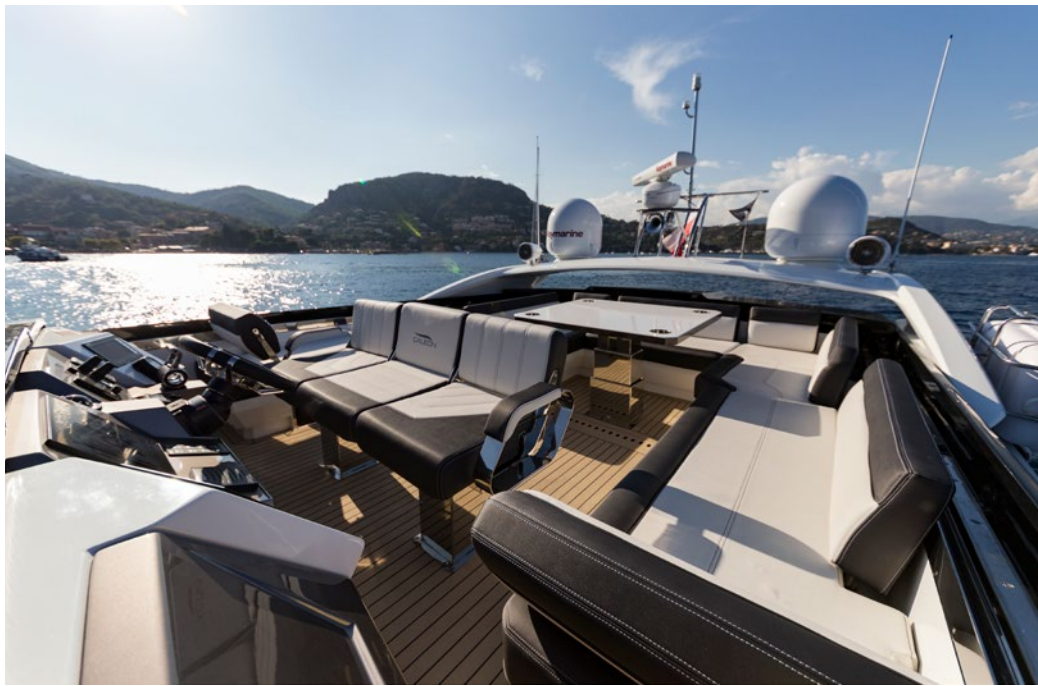
— Create magical moments on a huge upper deck area