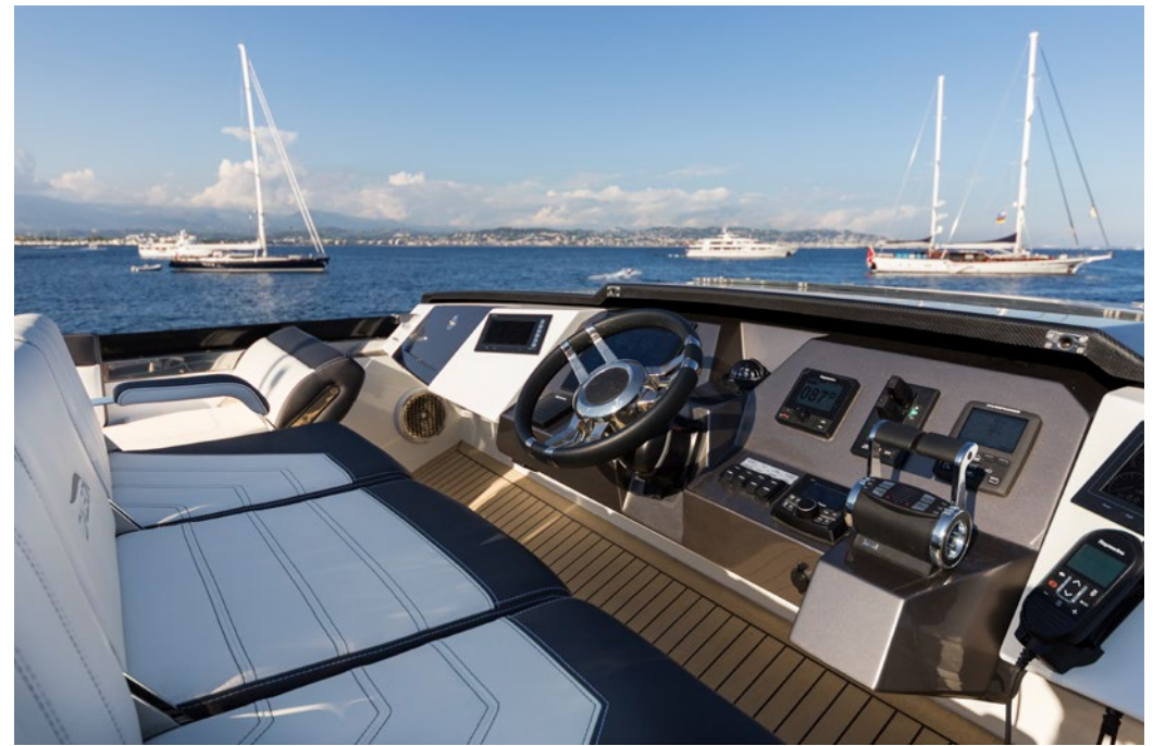
— The whole top deck can be quickly closed off by a carbon roof – genius!