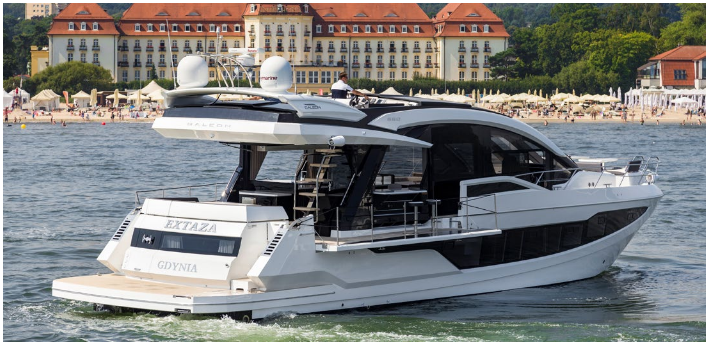
A hydraulic platform with access to the crew cabin