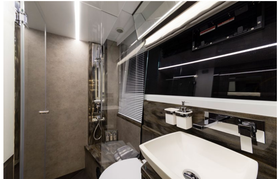
Large windows can be found in all cabins and bathrooms