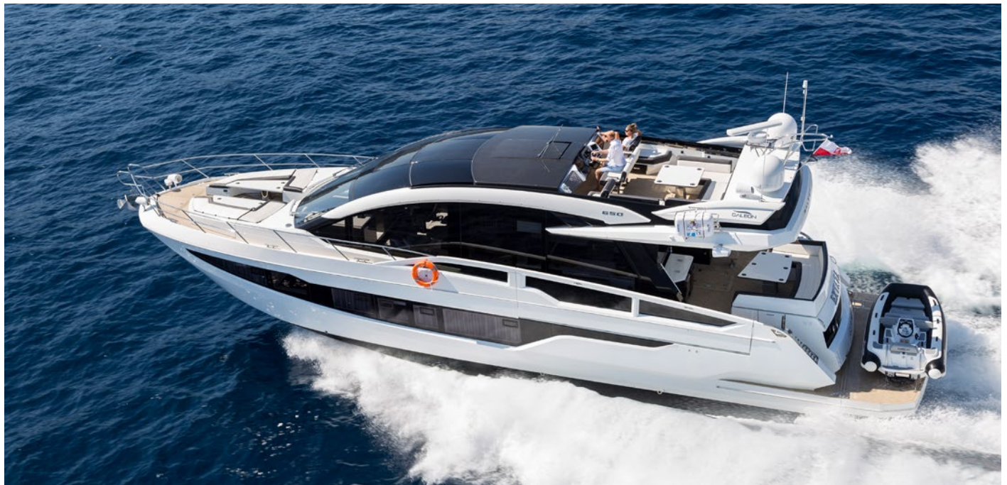
Find repose on fold-out sofas in the bow with an additional table