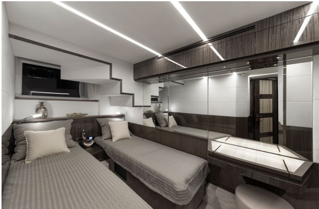
Twin beds in the guest cabin