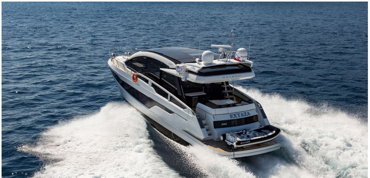
Beach Mode in this model is partly glazed