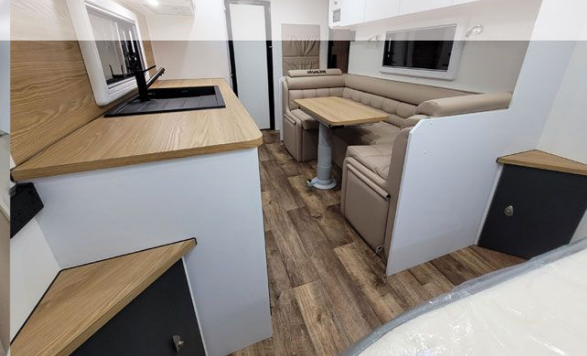
PULL OUT KITCHEN