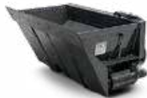
Side Discharge Bucket