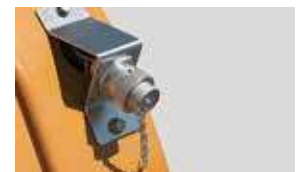
Front Electric/ Multi-Function