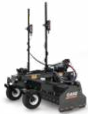
Laser Grading Box

All models come standard with a universal coupler that will work with numerous attachment manufacturers, meaning you can do more with a single machine to give your business even greater versatility. Consult your dealer for details.