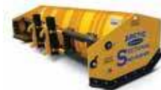
Arctic® Sectional Sno-Pusher™