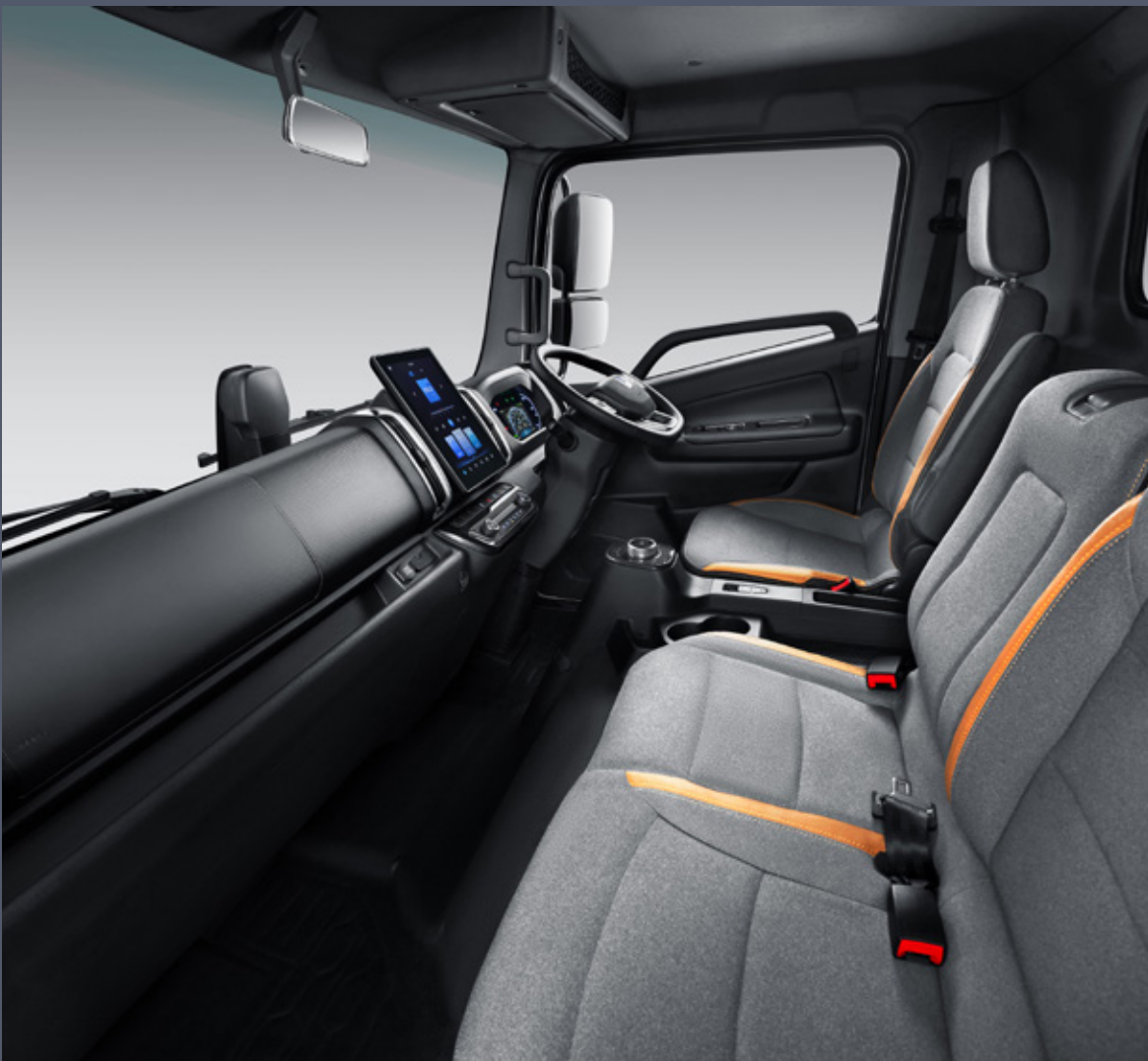
Premium fabric seats