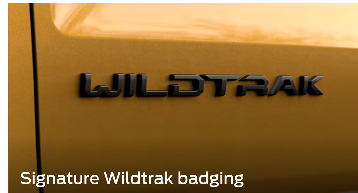
Signature Wildtrak badging