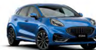
Desert Island Blue*^