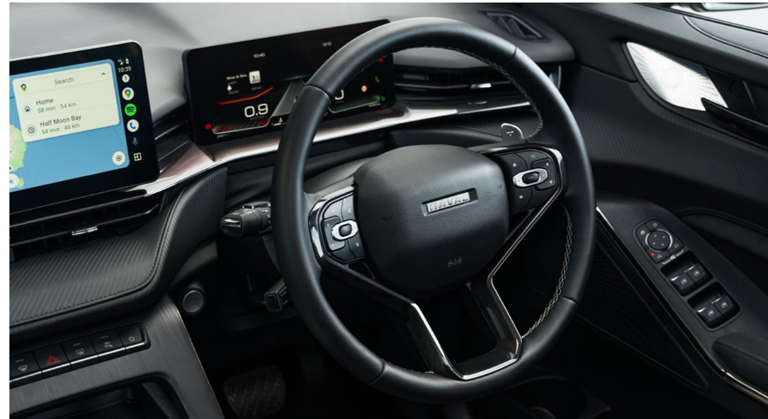
Multi - Function Steering Wheel