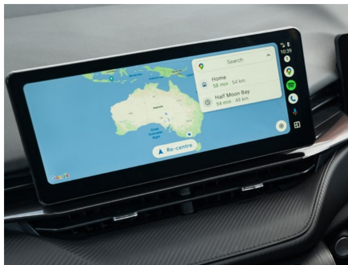
12.3 inch Full Colour Touch Screen Infotainment System