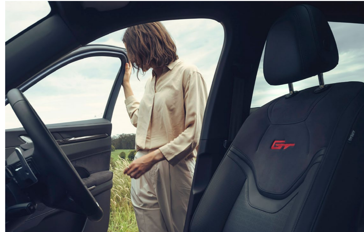
Signature GT embroided seats