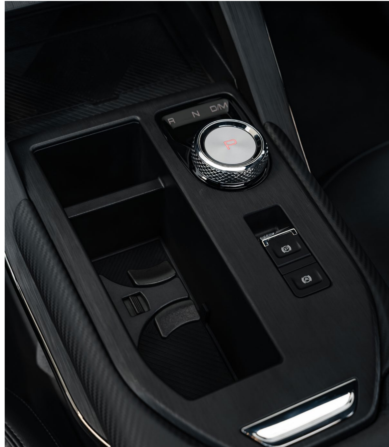
Rotary gear shift dial