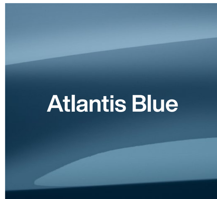
Premium Colour (+$495)