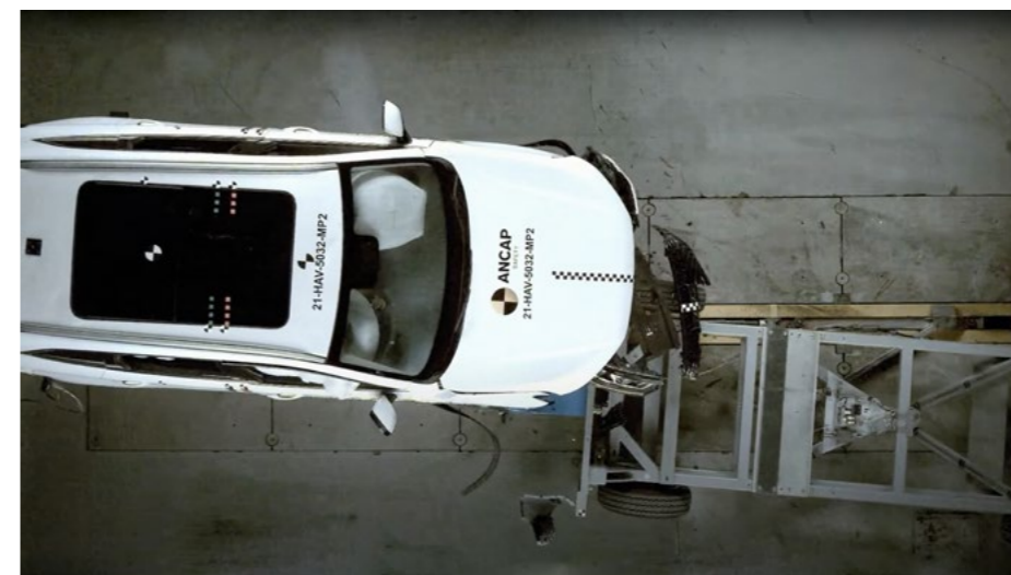
ANCAP Safety test

This sporty and stylish SUV is also unbelievably safe. Having achieved the highest possible 5 star safety rating by ANCAP, the Haval H6GT comes with a comprehensive suite of safety systems designed to protect you and others on the road. Advanced safety features including Intelligent Adaptive Cruise Control, Lane Keep Assist, Traffic Sign Recognition, Traffic Jam Assist, and Auto Parking Assist* all combine to give you peace of mind knowing that GWM is looking out for you and everyone else around you every time you drive.