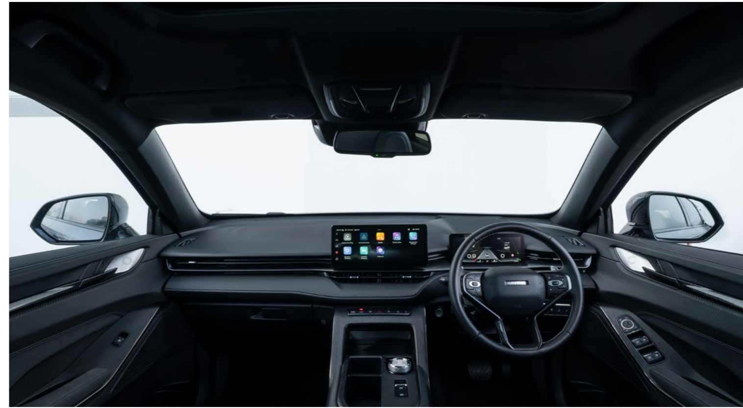
Spacious cabin design