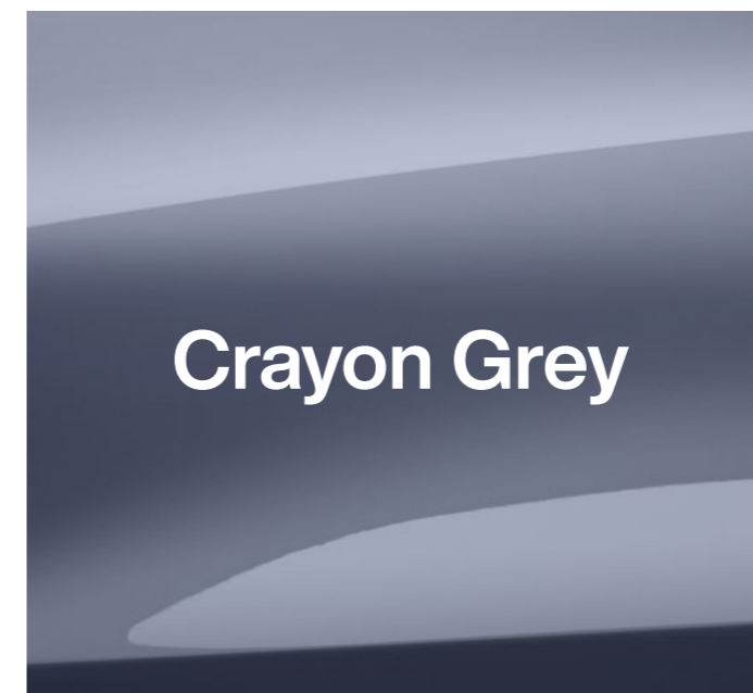
Premium Colour (+$495)