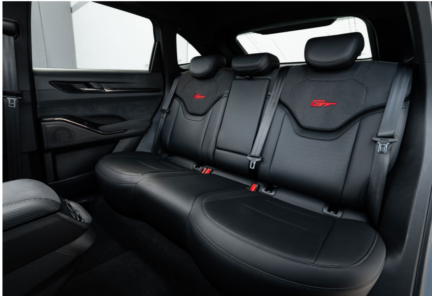
Rear Seats 60/40 Split