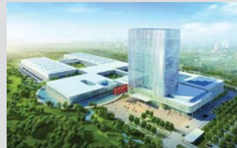
HAVAL research and development centre