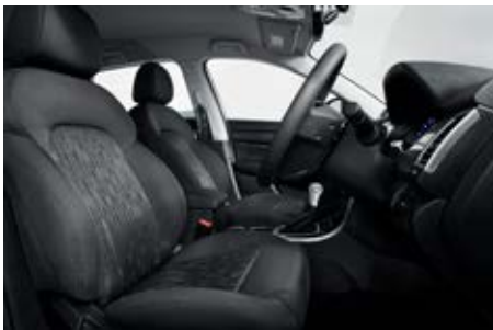
Top: Fabric seats (Premium model) Bottom: Apple CarPlay™