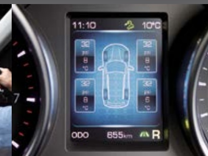
Tyre Pressure Monitoring System (TPMS)