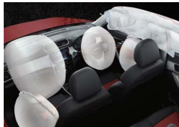
Front dual, front dual side and integrated side curtain airbags.

The perfect combination of reversing sensors and reversing camera provides you with accurate information when reversing out of driveways or car parks.