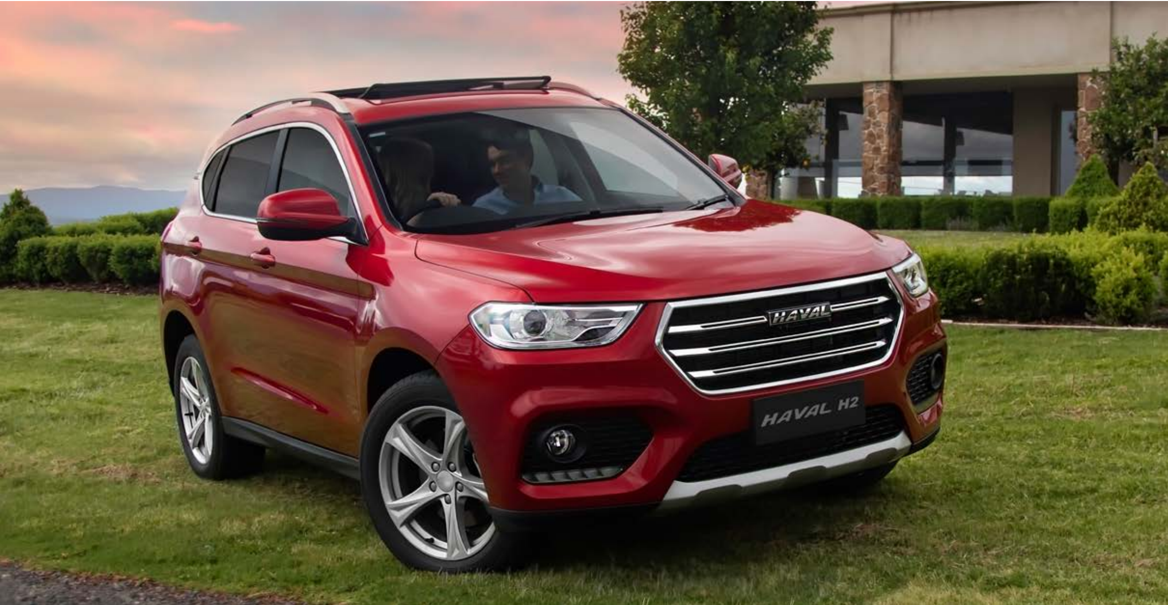
LUX model shown