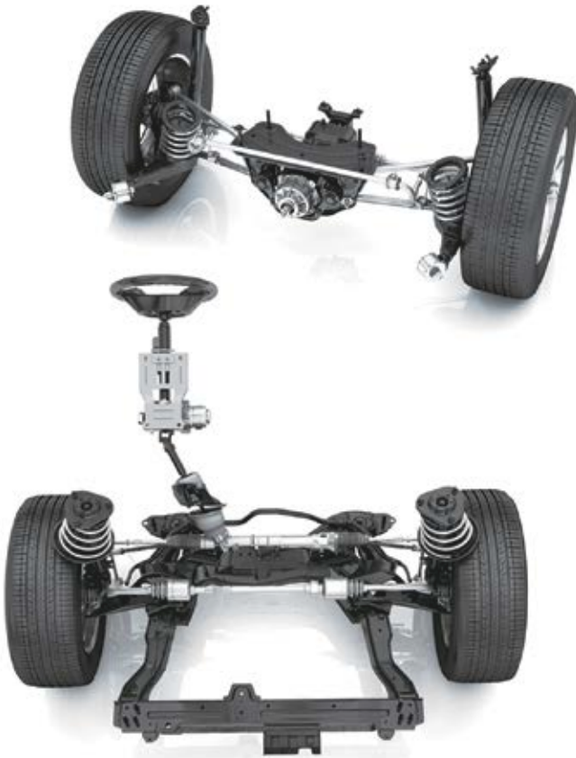
Front MacPherson + Rear Multi-Link Independent Suspension.