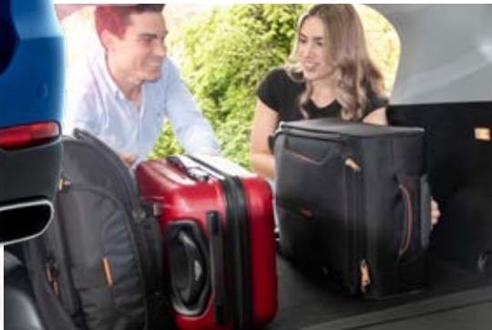
Generous rear cargo area