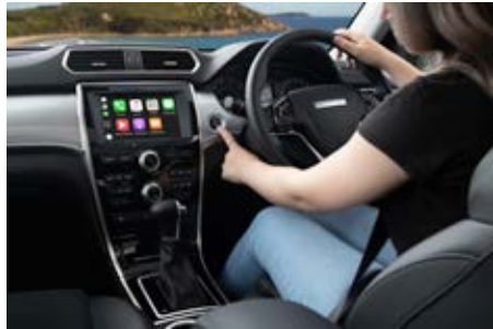
Top: Push button start /stop Bottom: Panoramic sunroof (LUX model)