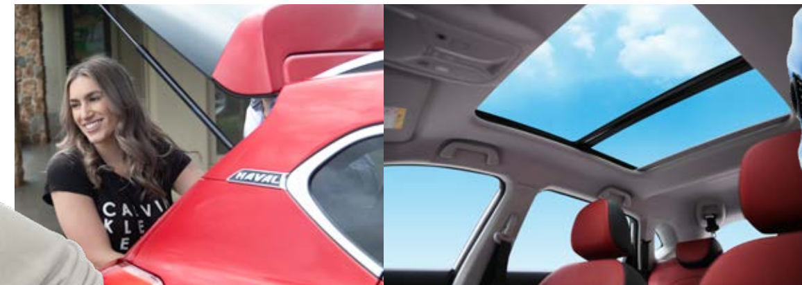
Panoramic sunroof & optional two-tone interior (LUX model)