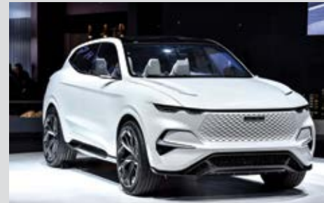
HAVAL 2025 concept vehicle