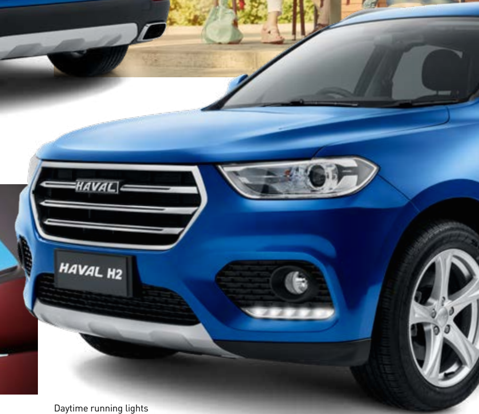
Daytime running lights