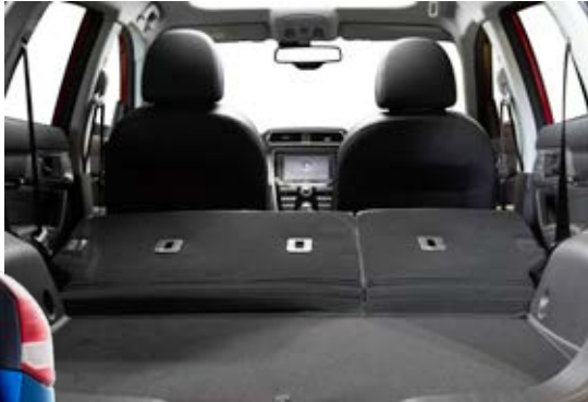
60/40 split rear folding seats