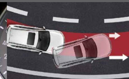
Electronic Stability Program (ESP)