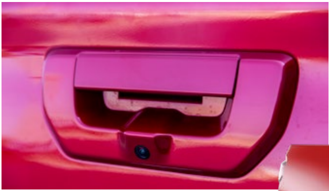
▲ Reversing camera