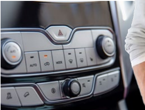
^ Overseas model shown. Specifications may vary.