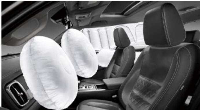
▲ Front, side, centre and curtain airbags ^