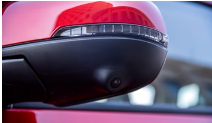
▲ Curbside camera