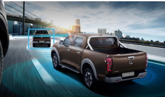
▲ 360 view camera, FCW+AEB, Lane Change Assist & Lane Departure Warning^