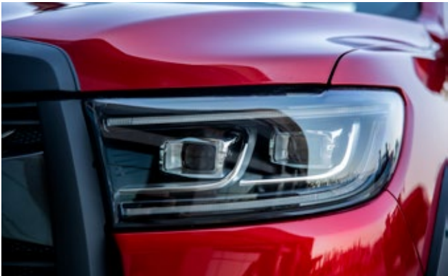
▲ LED headlights with daytime running lights