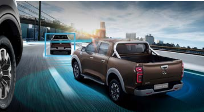
▲ 360 view camera, FCW+AEB, Lane Change Assist & Lane Departure Warning^