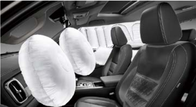
▲ Front, side, centre and curtain airbags ^