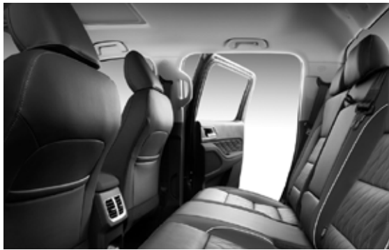
▲ Rear seats^