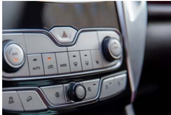
^ Overseas model shown. Specifications may vary.