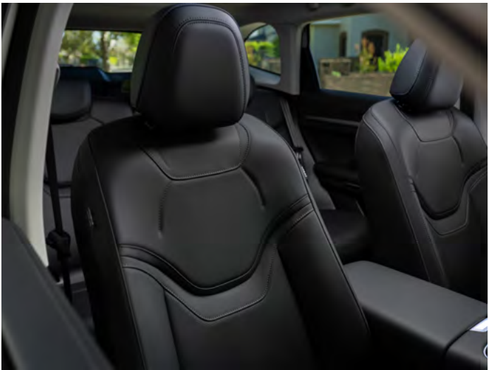
8-way electric adjustable driver seat*