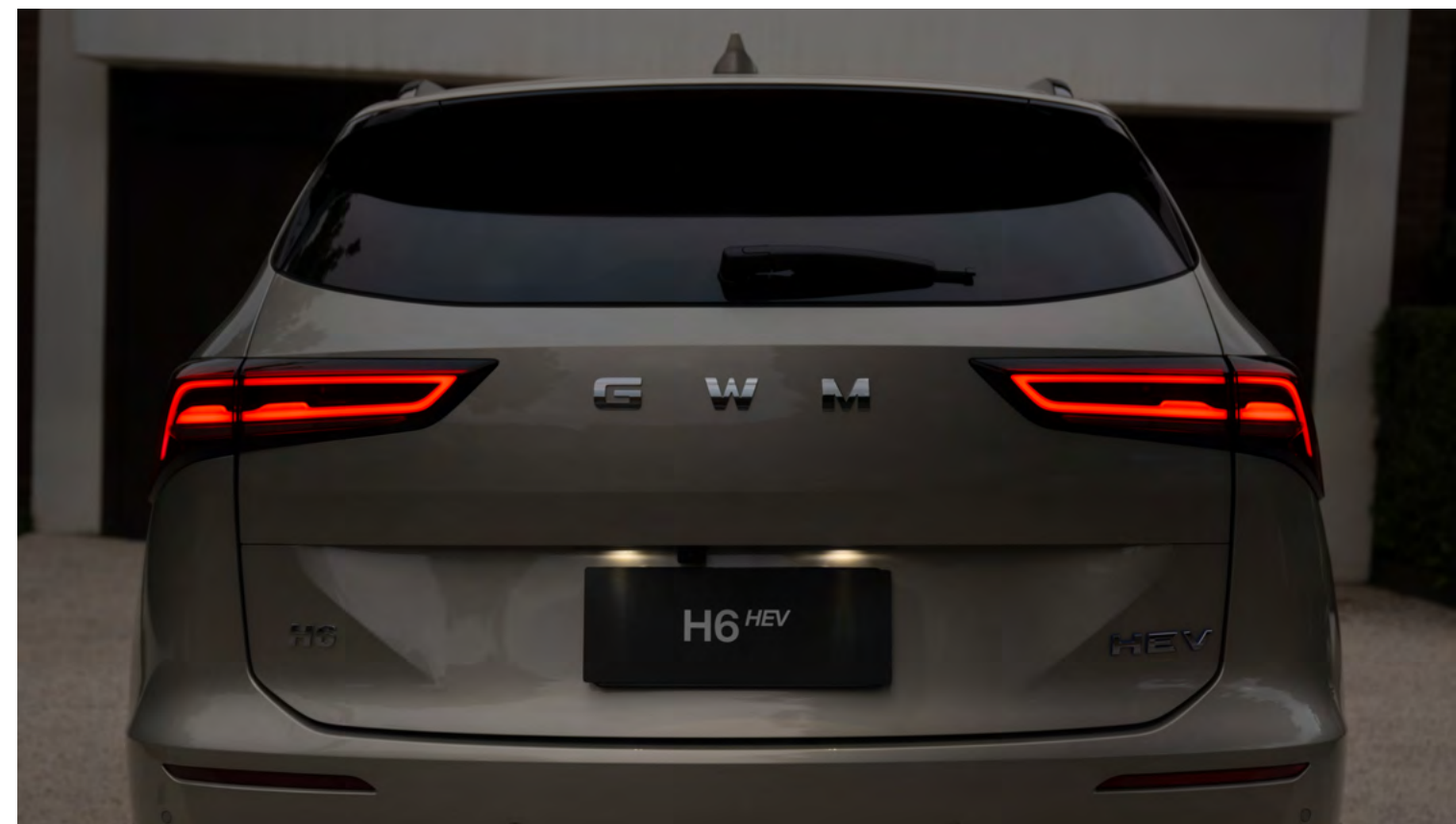
Electric kick sensing tailgate