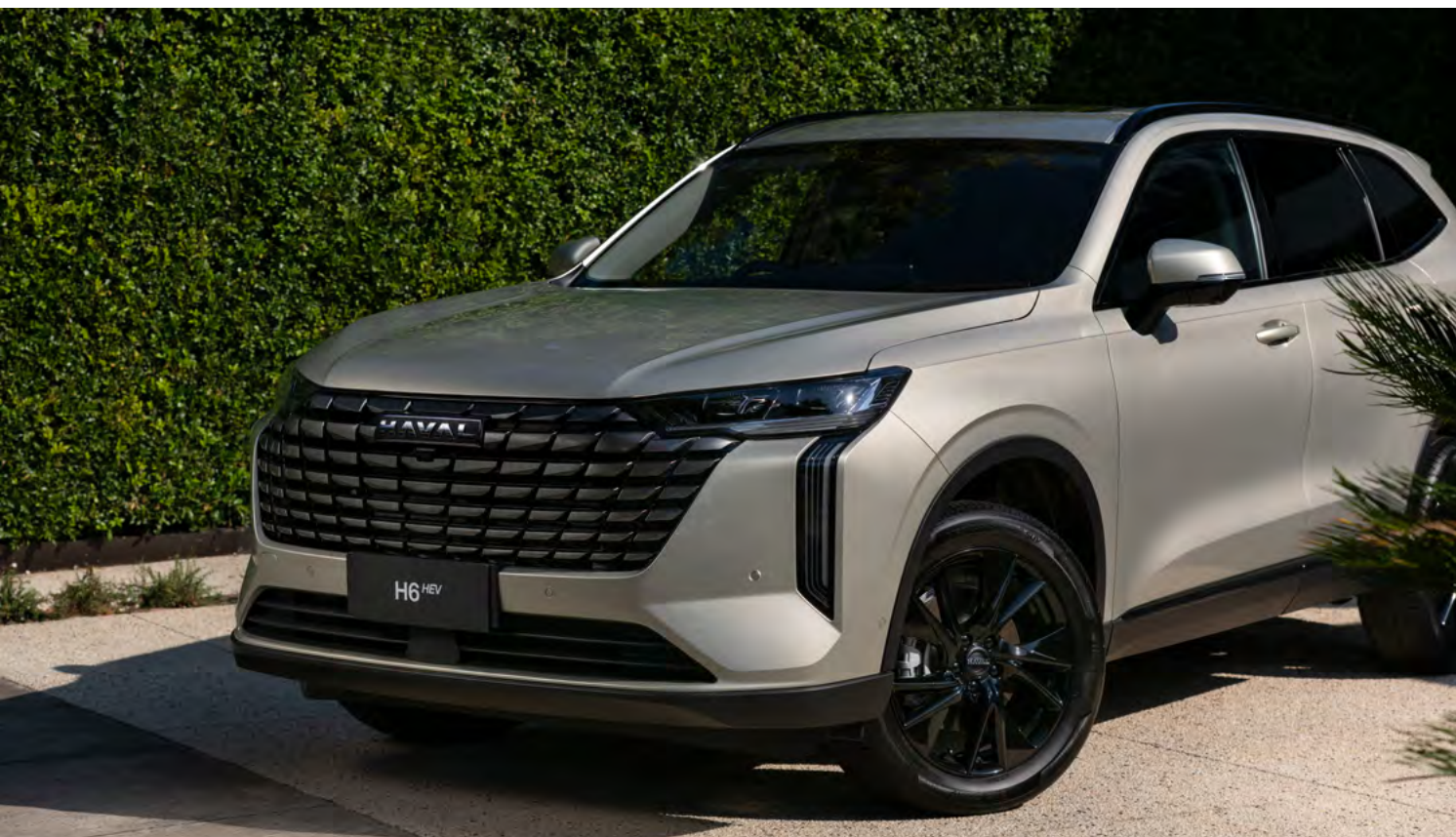
Signature front grille

From the impressive front to the stylish back, every inch of the H6 has been meticulously considered. Whether you're ducking out to the shops, or roaming far on a road-trip, your most versatile accessory will always be with you.