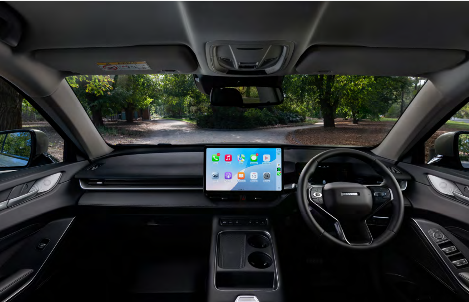
14.6" Infotainment screen