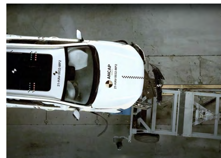
ANCAP Safety test

This bold and stylish SUV is also unbelievably safe. The Haval H6 comes with a comprehensive suite of safety systems designed to protect you and others on the road. Advanced safety features including Intelligent Adaptive Cruise Control, Lane Keep Assist, Traffic Sign Recognition, Traffic Jam Assist, and Auto Parking Assist* all combine to give you peace of mind knowing that GWM is looking out for you and everyone else around you every time you drive.