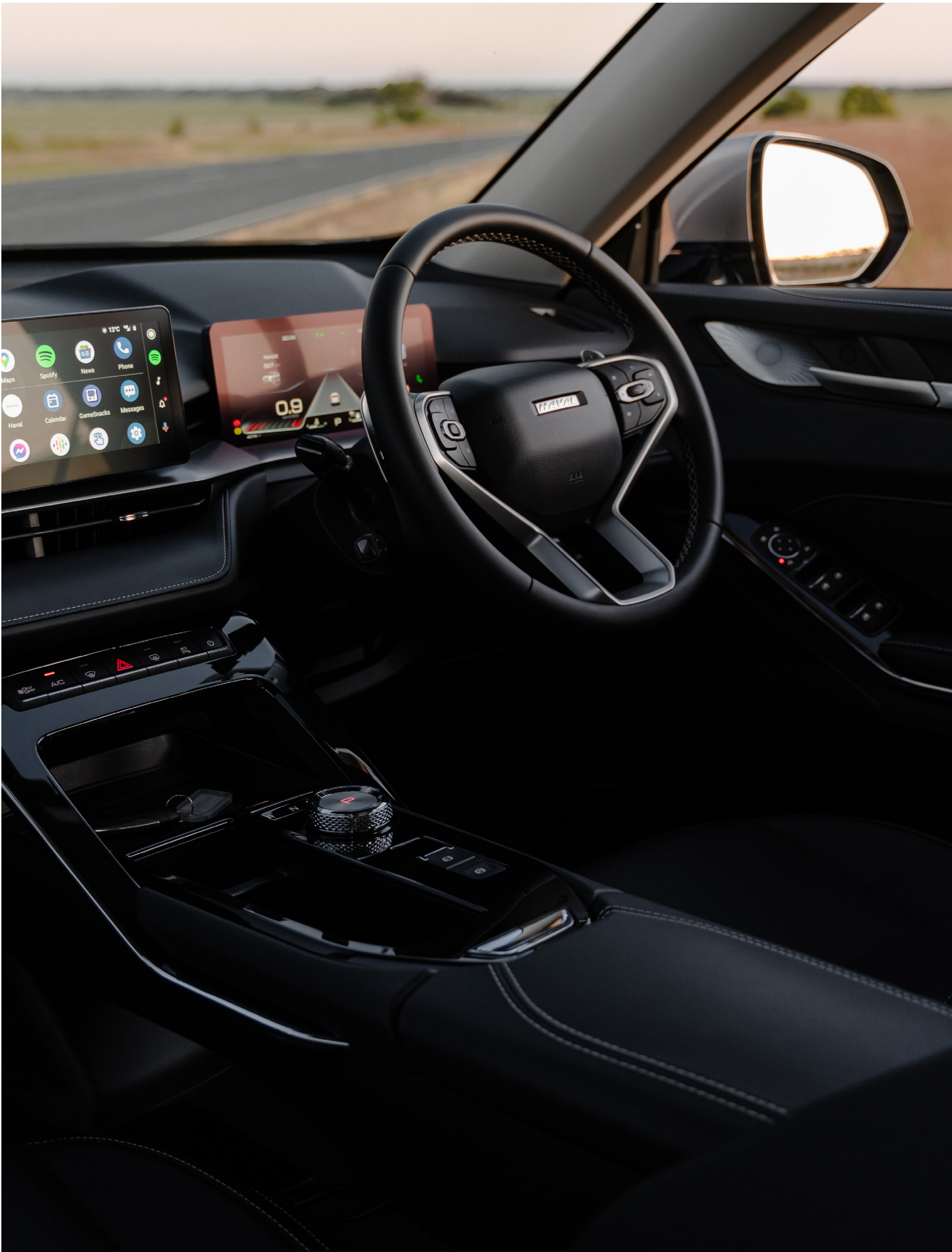
Sophisticated cabin design