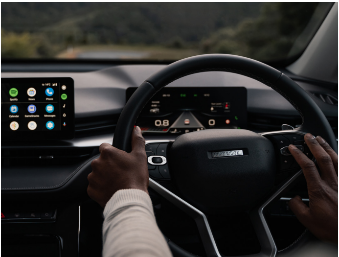
10.25" Full colour instrument cluster with heads up display*