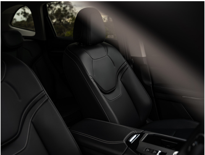
8-way electric adjustable driver seat*