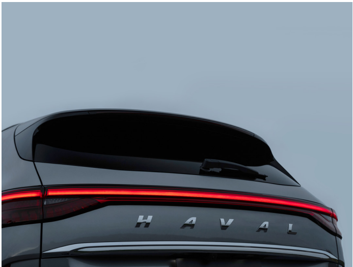
Electric Tail Gate with Memory Function*

The H6 is a technologically advanced SUV designed for those who want more in life. Features such as auto parking assist, a 12.3" multimedia touchscreen and a heated faux leather steering wheel give this SUV its distinct edge.*