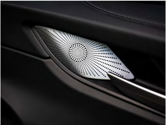
9 speaker audio system*

The H6 is a technologically advanced SUV designed for those who want more in life. Features such as auto parking assist, a 14.6" multimedia touchscreen and a heated faux leather steering wheel give this SUV its distinct edge.