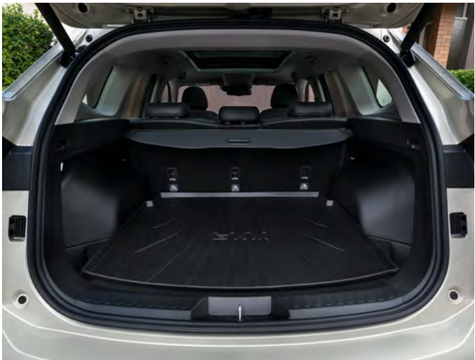
560L boot capacity (1485L max)

The H6 is a technologically advanced SUV designed for those who want more in life. Features such as auto parking assist, a 14.6" multimedia touchscreen and a heated faux leather steering wheel give this SUV its distinct edge.