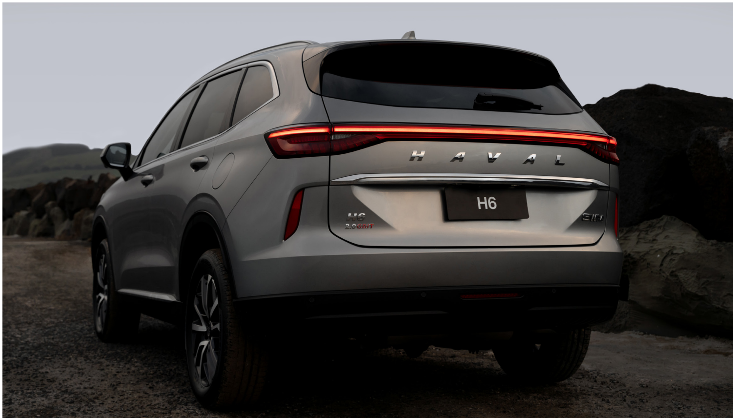
LED full width tail light