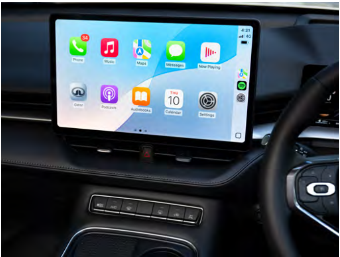
Wireless Apple CarPlay & Android Auto