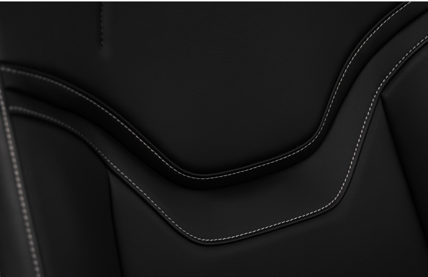
Comfort-Tek faux leather accented seats^