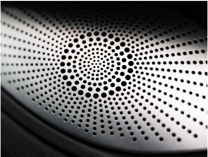
Premium DTS sound system*

The H6 is a technologically advanced SUV designed for those who want more in life. Features such as auto parking assist, a 12.3" multimedia touchscreen and a heated faux leather steering wheel give this SUV its distinct edge.*