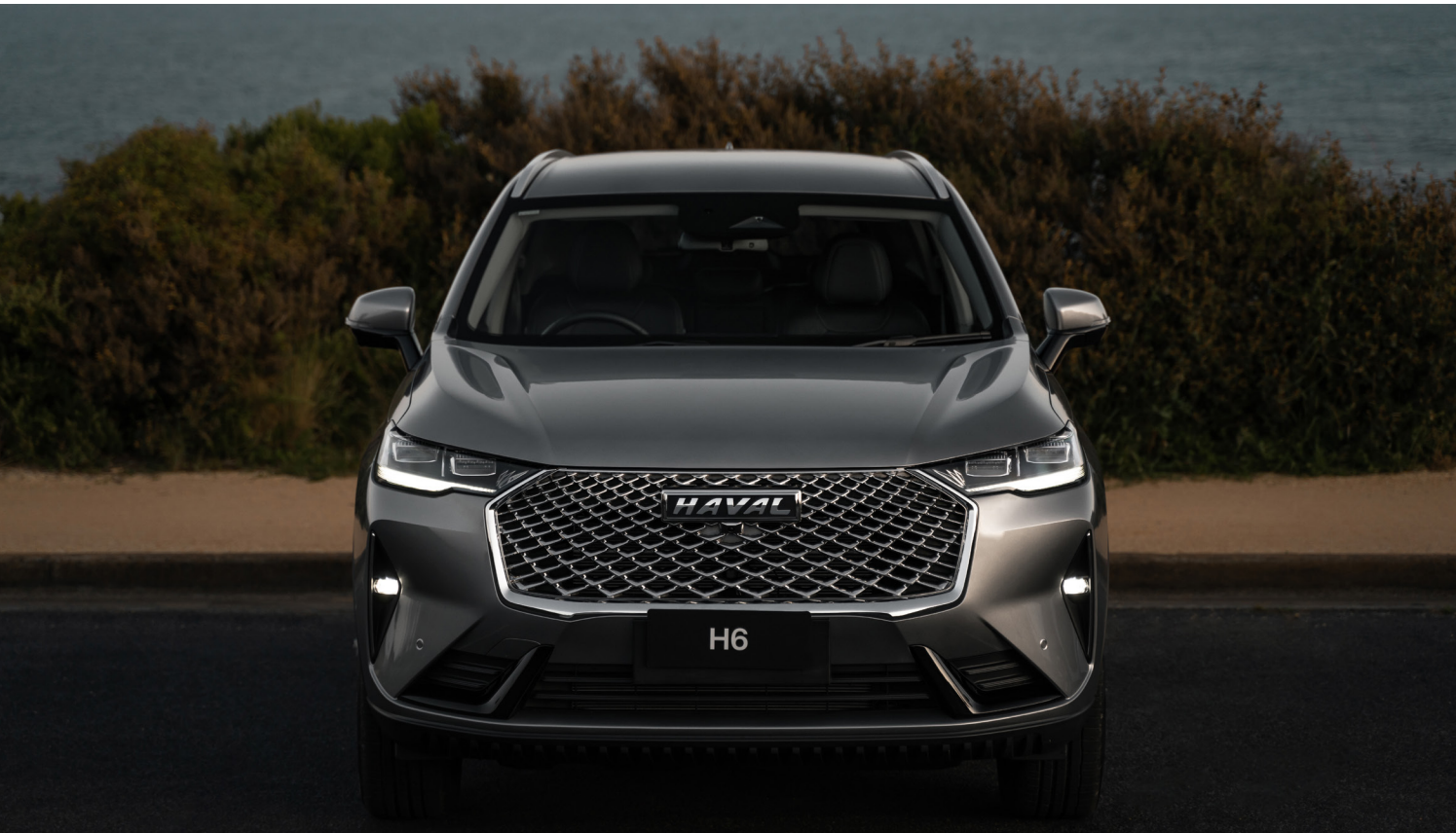
Signature front grille

From the impressive front to the stylish back, every inch of the H6 has been meticulously considered. Whether you're ducking out to the shops, or roaming far on a road-trip, your most versatile accessory will always be with you.