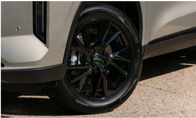
19" Alloy wheels