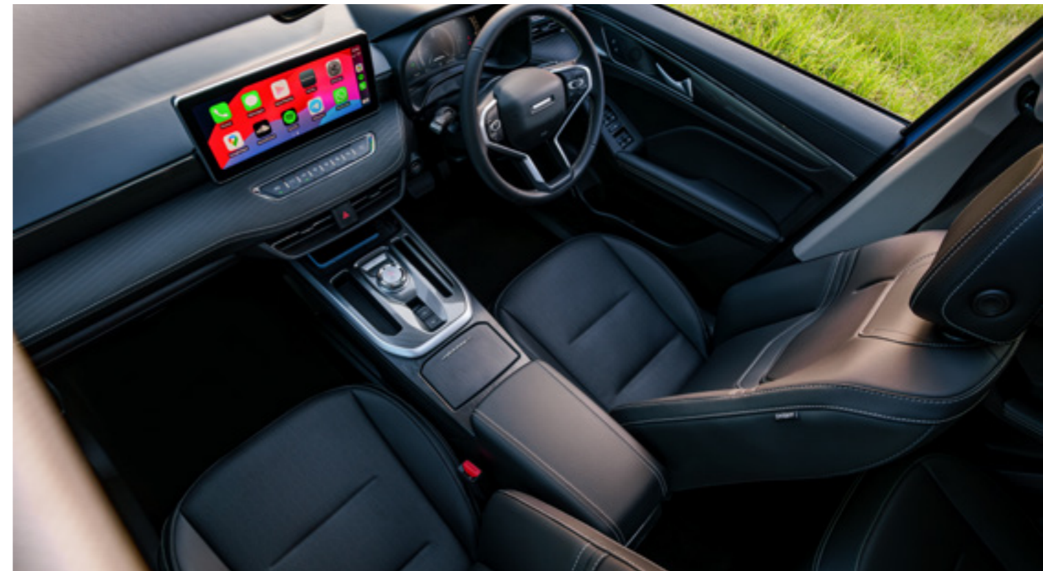
Wired Apple CarPlay (R) & Android Auto (TM)