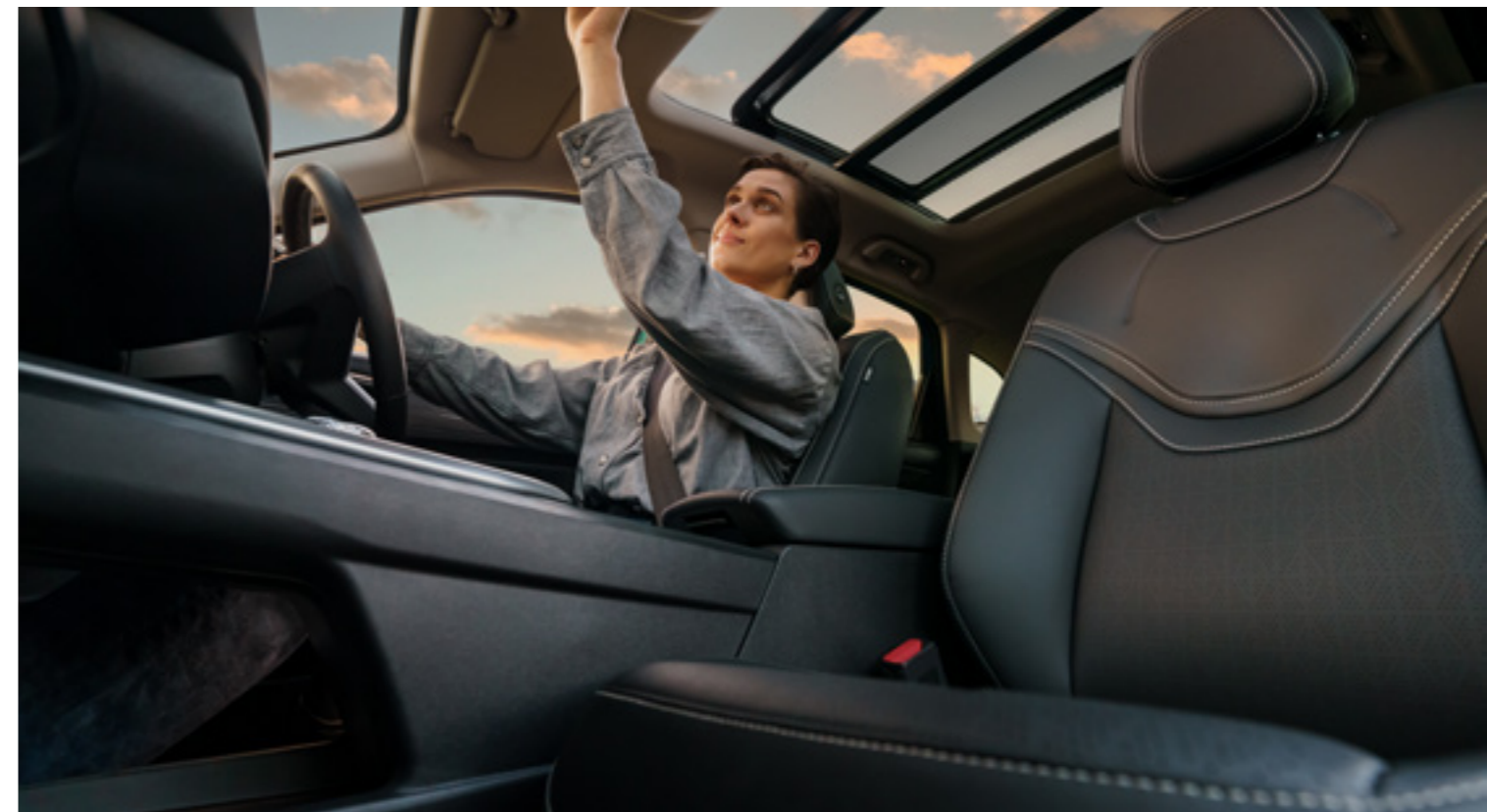
Electric panoramic sunroof^