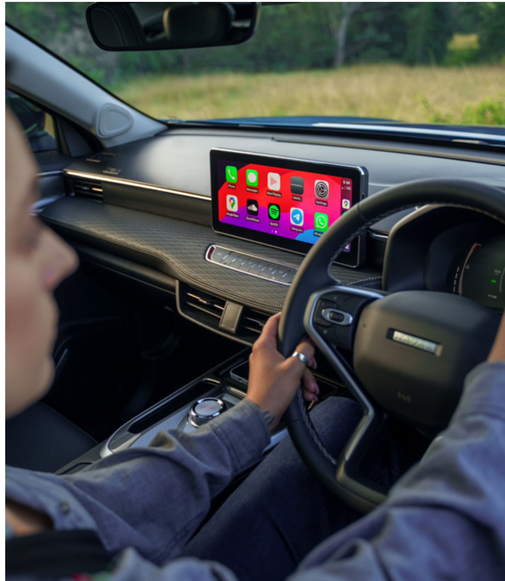
10.25" or 12.3" touch screen infotainment