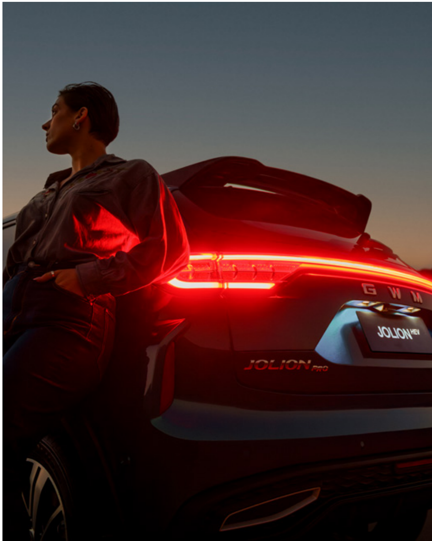
Change to Elegant LED brake light bar*