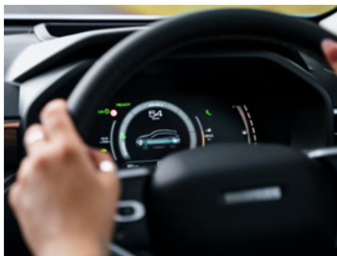
7" full colour instrument cluster*