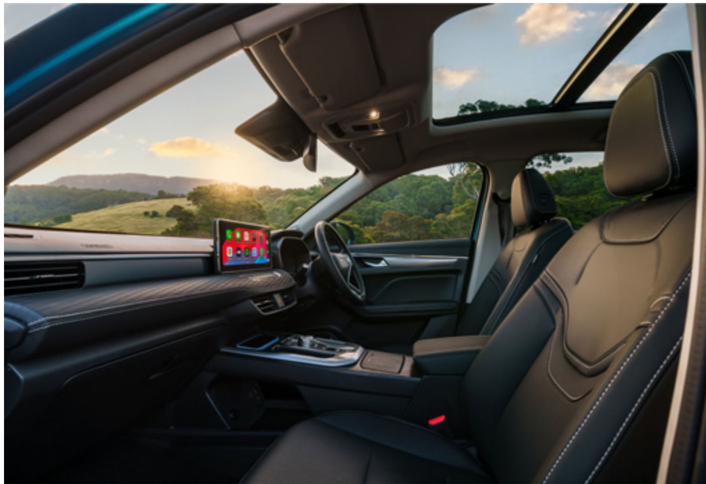
Comfort-Tek faux leather accented seats