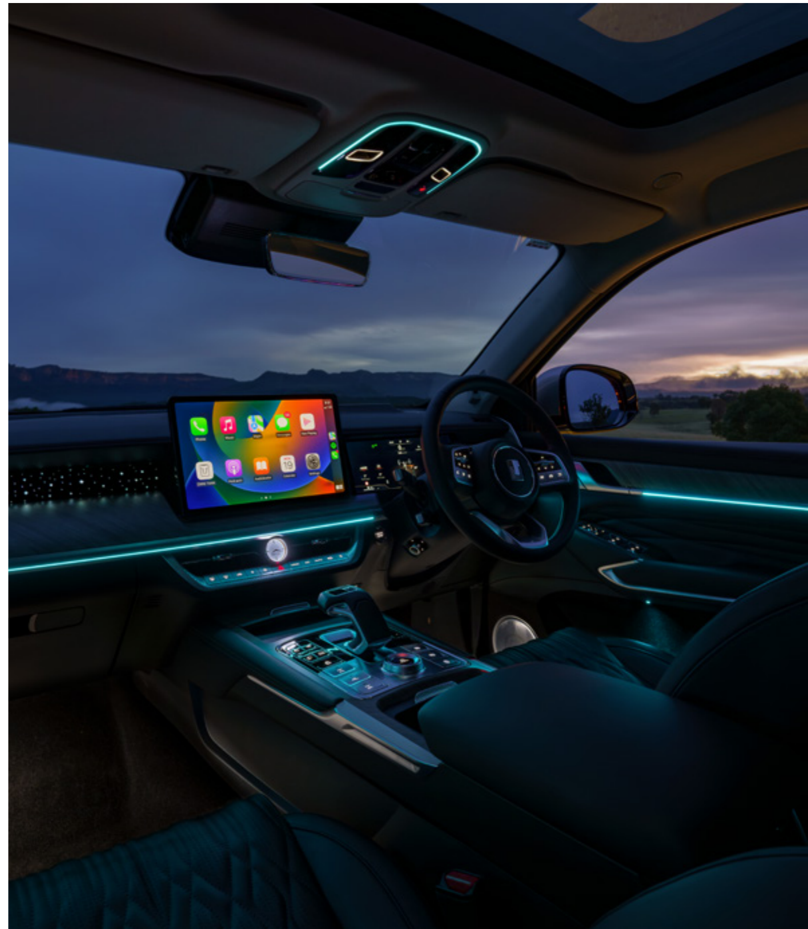
64 colour ambient lighting*