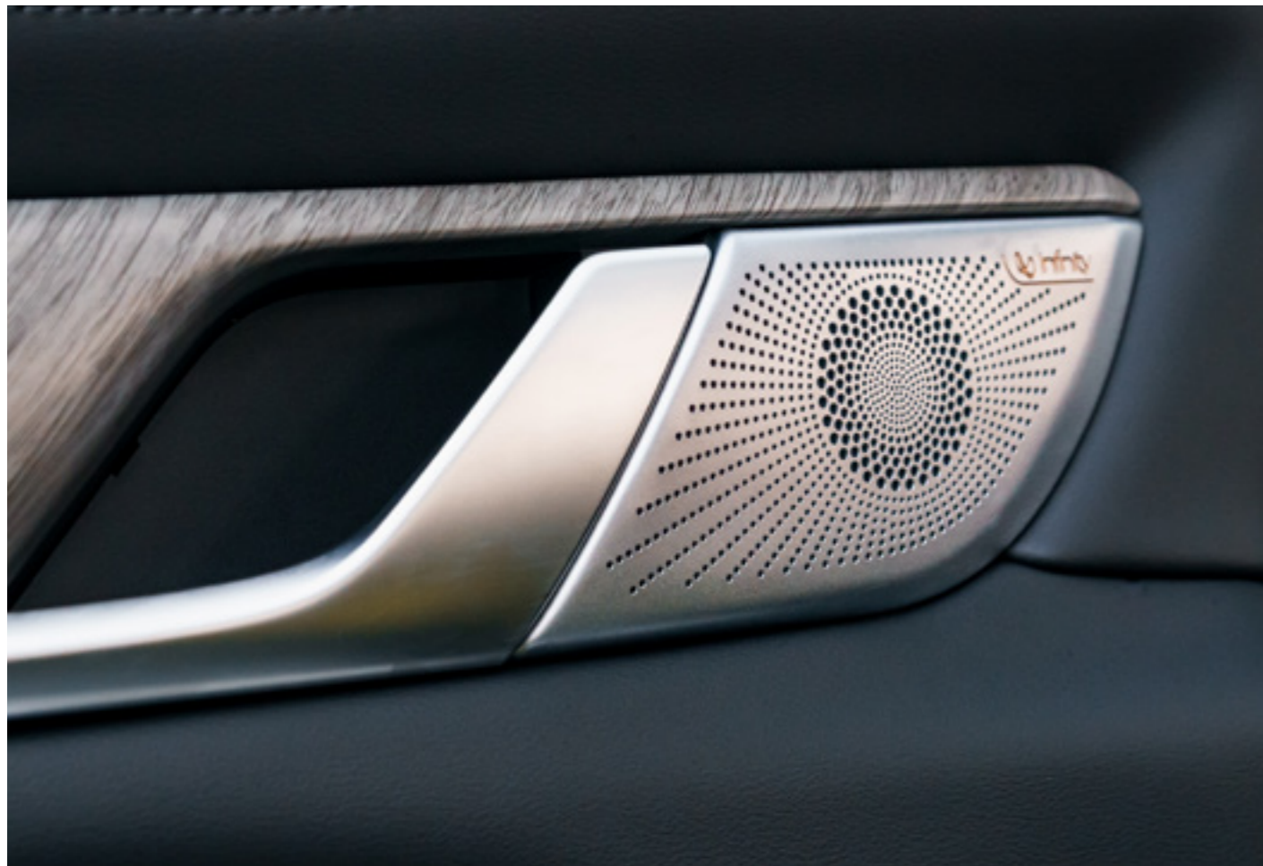
12 speaker Infinity™ sound system*