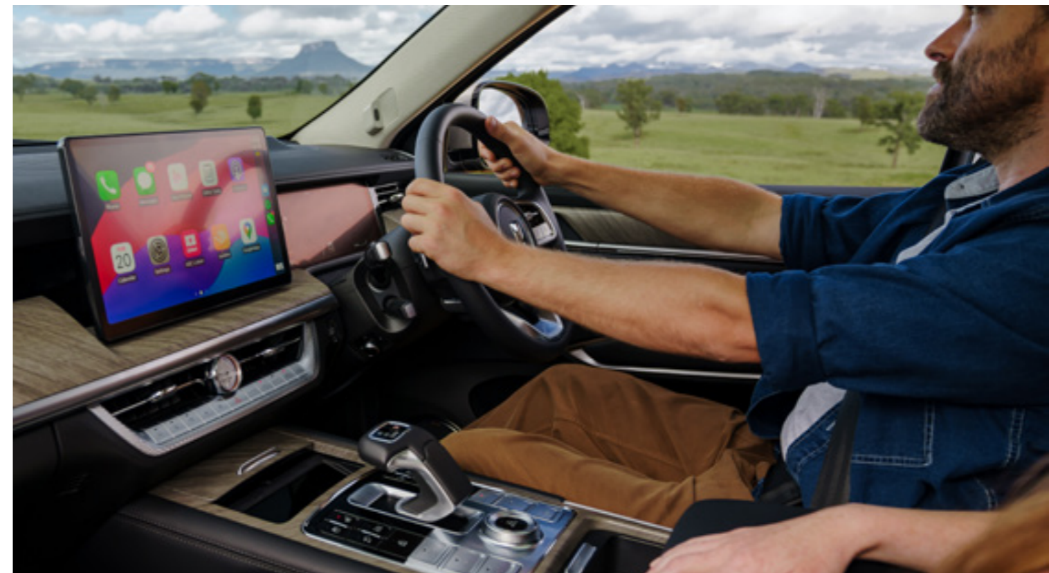
Multi function faux leather steering wheel