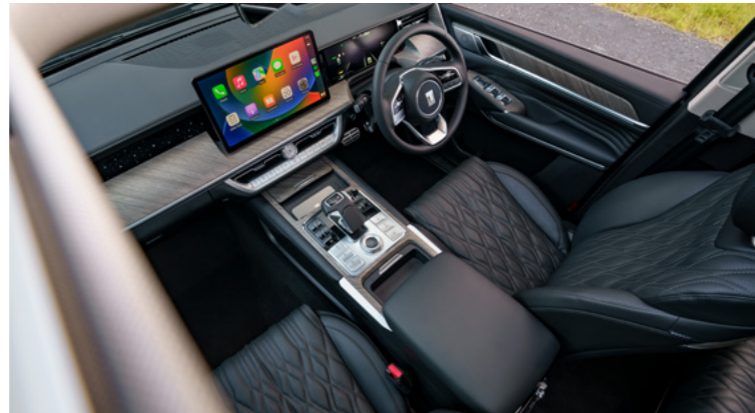
8-way power driver seat adjustment + 4-way lumbar support*