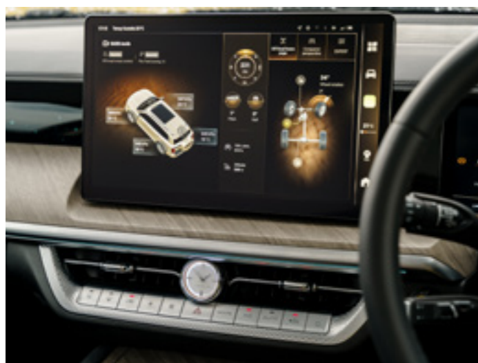
14.6" infotainment screen