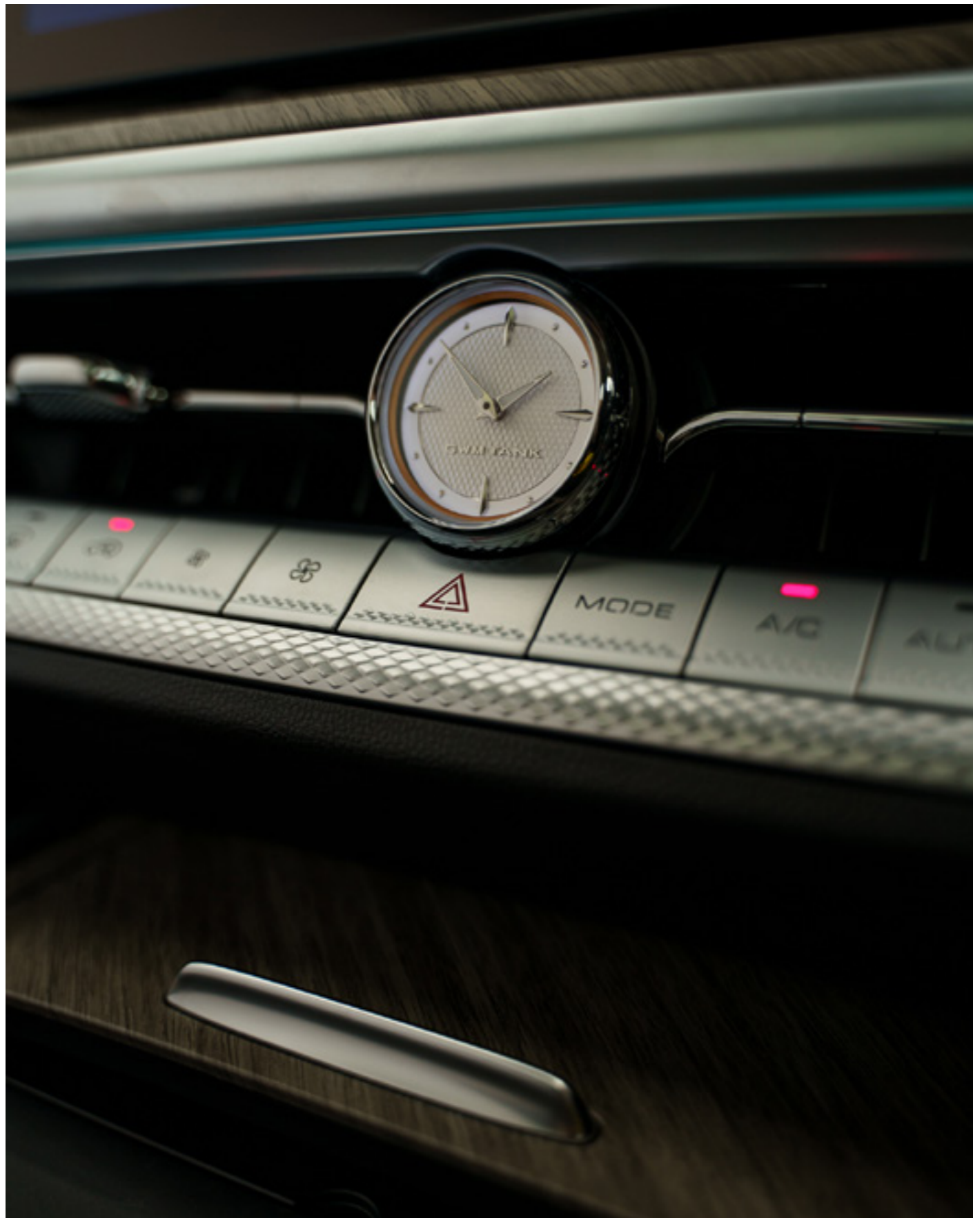
Purposefully designed centre console