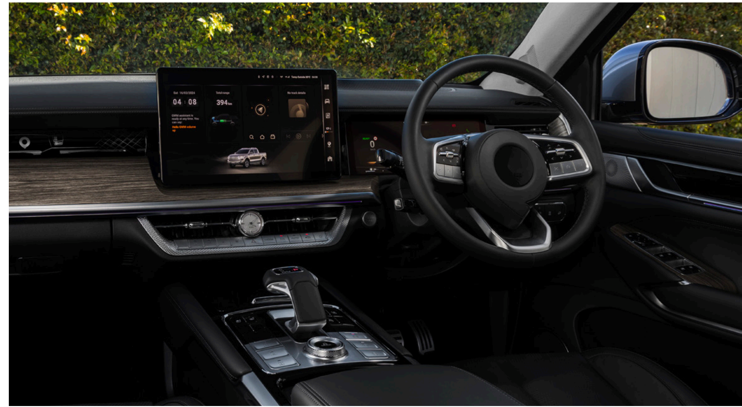
Premium appointed cabin