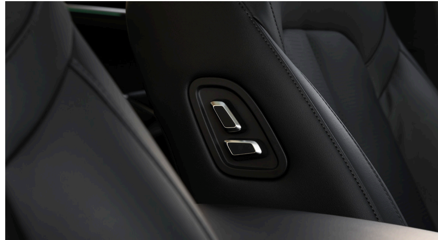
Front passenger VIP switch*