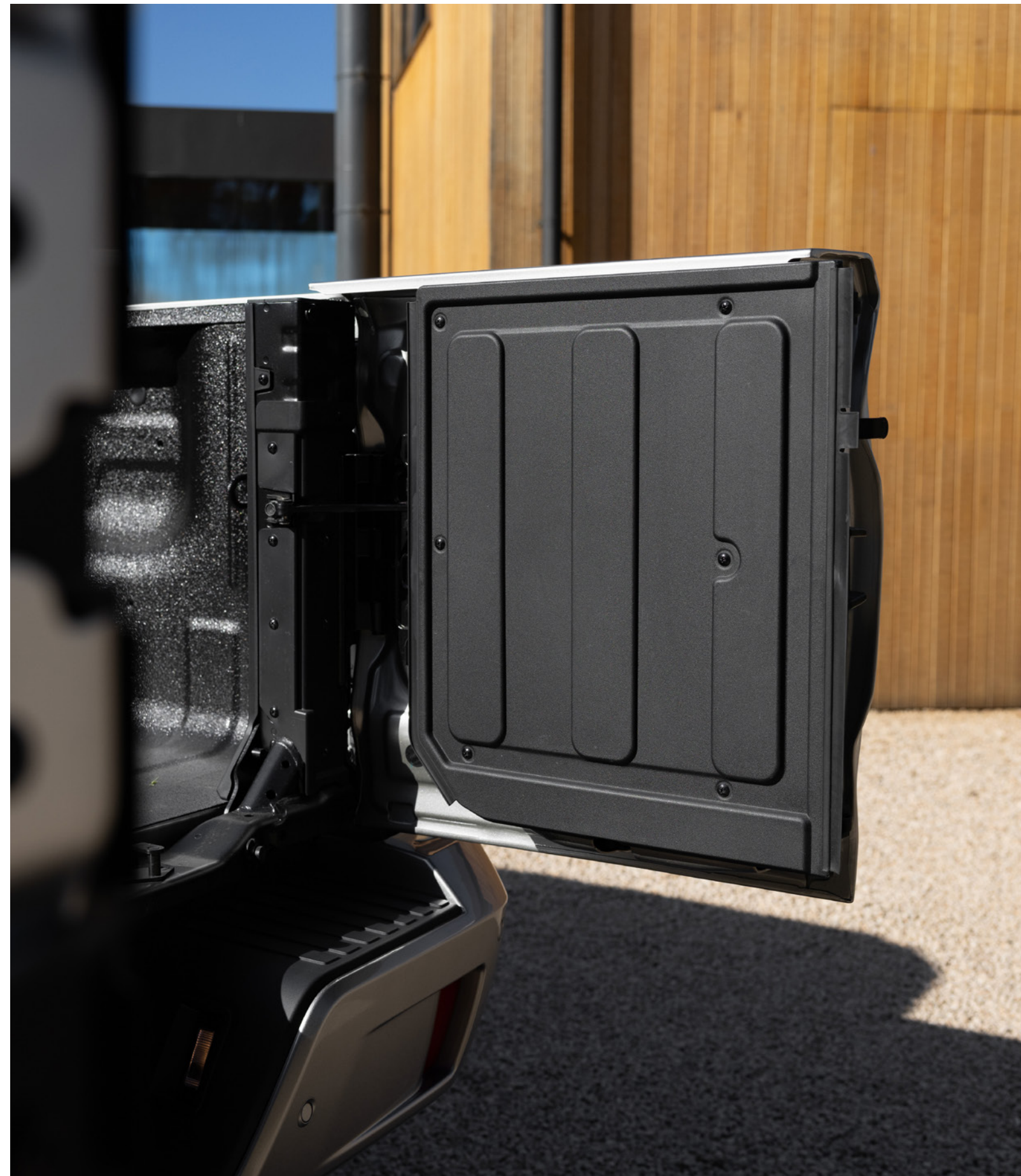
60/40 split tailgate*