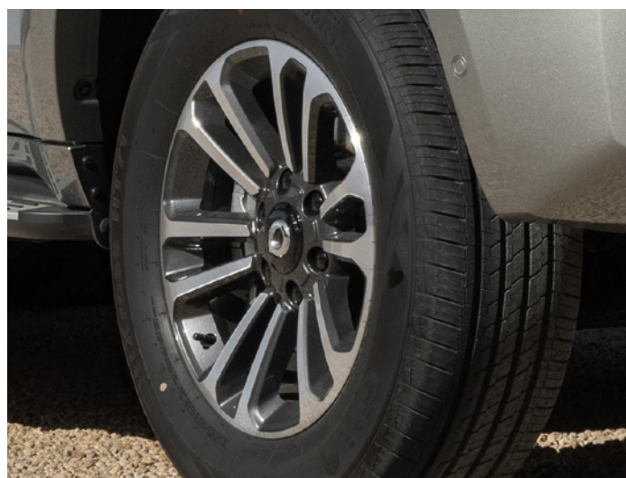
18" alloy wheels