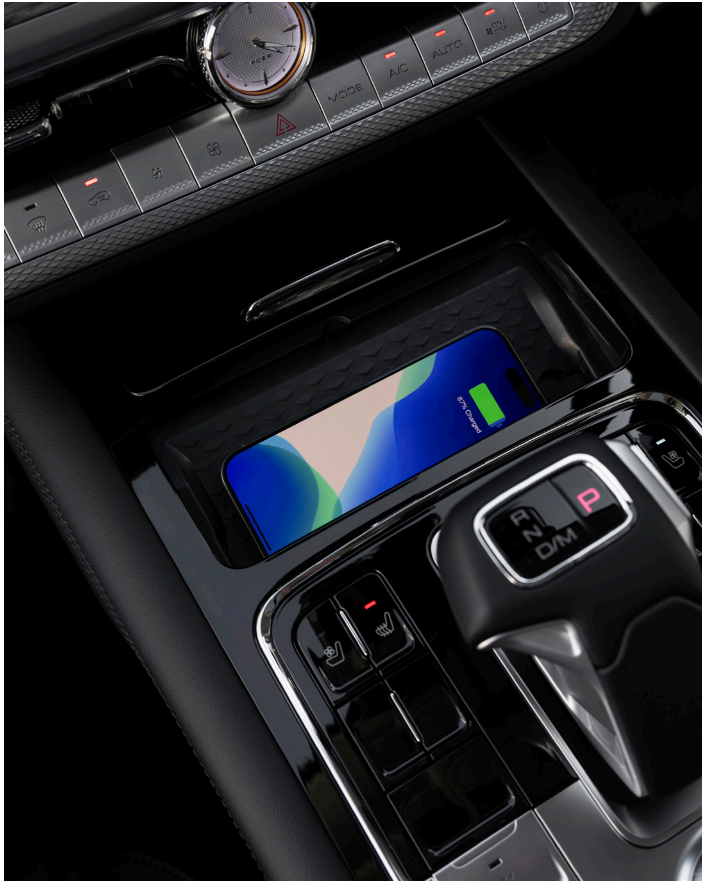
Wireless charging port*