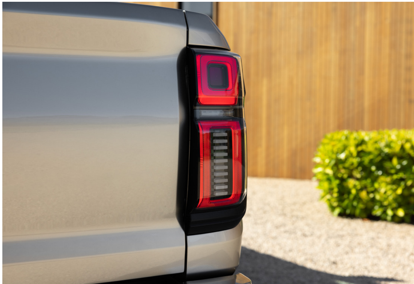
LED tail lights