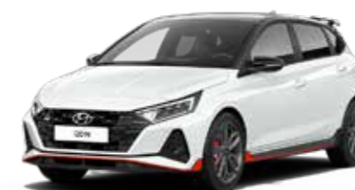
Polar White Solid