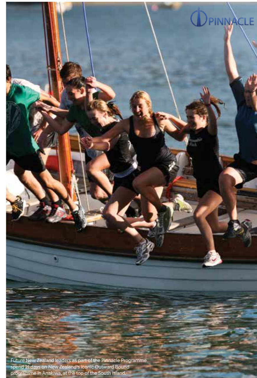
Future New Zealand leaders as part of the Pinnacle Programme spend 21 days on New Zealand's iconic Outward Bound programme in Anakiwa, at the top of the South Island.