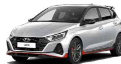
Sleek Silver Metallic