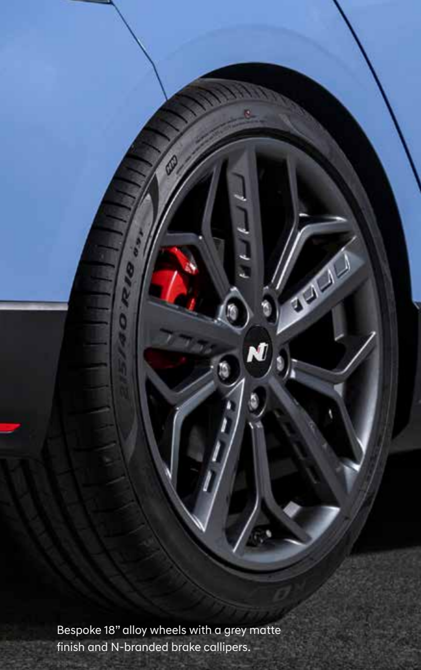
Bespoke 18" alloy wheels with a grey matte finish and N-branded brake callipers.