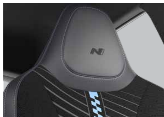
Exclusive Sports leather and cloth motorsport inspired seats with Performance Blue contrast stitching.

The sleek and sporty interior is as much about control as it is about comfort. The ergonomics are completely driver-focused, with everything in view and in reach. The perforated leather N steering wheel puts all the driving performance features right at your fingertips. Choose your drive mode or activate rev-matching for more fun at the push of a button. You can program the dedicated N keys on the steering wheel to activate your favourite set-up in an instant. The shift timing indicator located in the digital cluster lets you know when to shift gears for optimal racetrack performance. And the red zone of the variable rev counter changes in line with the engine's oil temperature.