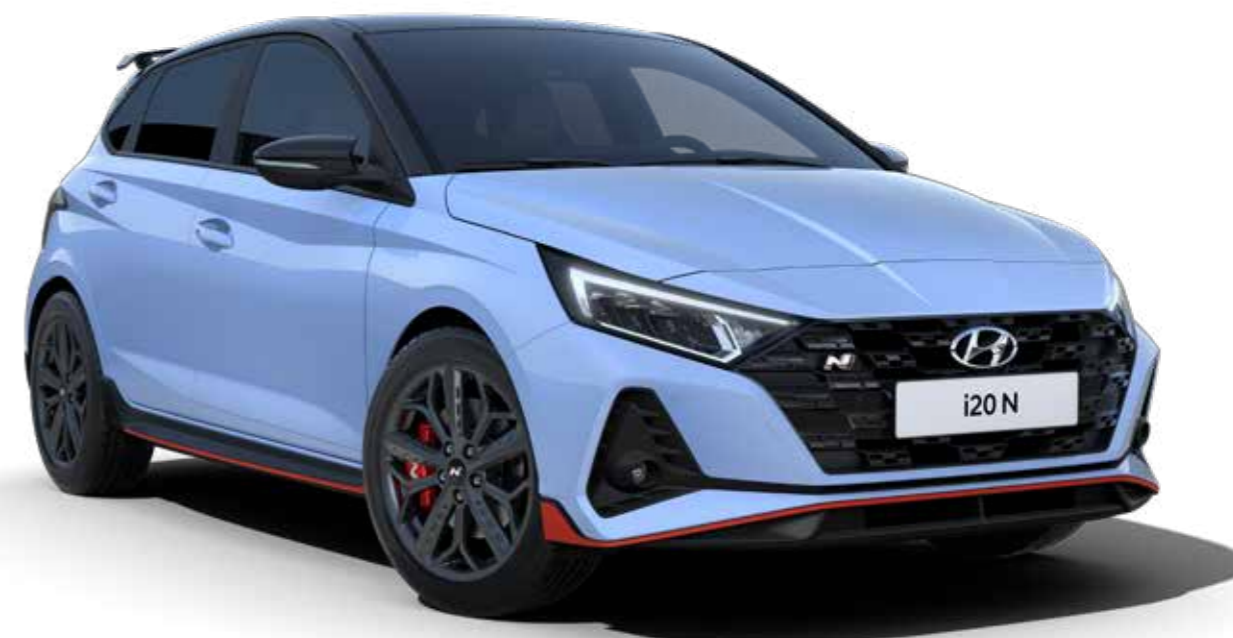
Performance Blue Solid with Phantom Black Pearl two-tone roof.

The dynamic choice of exterior colours includes the N signature Performance Blue, exclusive to Hyundai N models. An Phantom Black Pearl roof is available for two-tone style with a selection of colours.