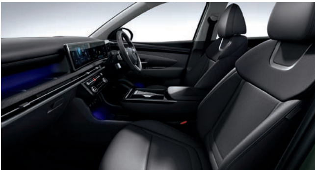
Obsidian black leather