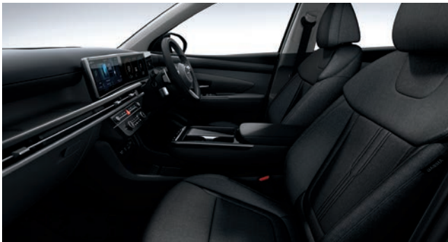
Obsidian black cloth