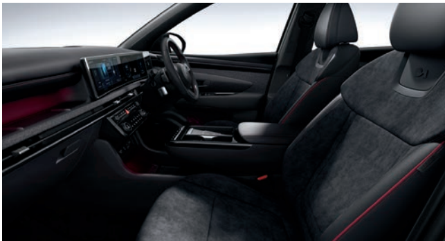
Obsidian black leather & alcantara with red accents