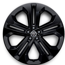
21" 10 SPOKE 'STYLE 5105' GLOSS BLACK