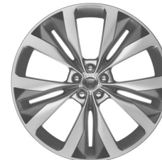
22" 15 SPOKE 'STYLE 1020' GLOSS SILVER WITH CONTRAST INSERTS