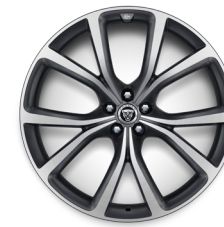
22" 5 SPLIT SPOKE 'STYLE 5081' FORGED, SATIN TECHNICAL GREY WITH DIAMOND TURNED FINISH