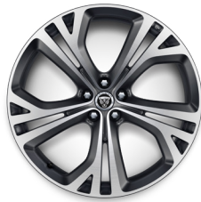
21" 5 SPLIT SPOKE 'STYLE 5080' FORGED, SATIN TECHNICAL GREY WITH DIAMOND TURNED FINISH