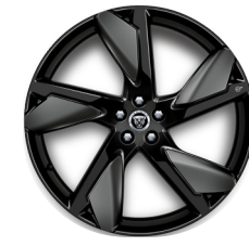
22" 5 SPLIT SPOKE 'STYLE 5117' FORGED, GLOSS BLACK WITH SATIN TECHNICAL GREY INSERTS