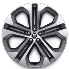
21" 5 SPLIT SPOKE 'STYLE 5104' SATIN DARK GREY WITH COONTRAST DIAMOND TURNED FINISH