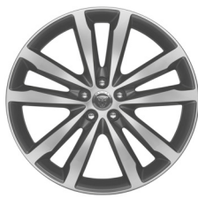
20" 5 SPLIT SPOKE 'STYLE 5031' GLOSS GREY WITH CONTRAST DIAMOND TURNED FINISH