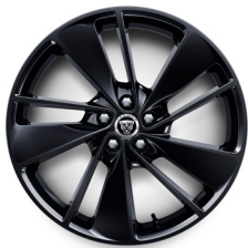
20" 10 SPOKE 'STYLE 1067' GLOSS BLACK