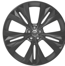
22" 15 SPOKE 'STYLE 1020' GLOSS BLACK WITH SATIN BLACK INSERTS