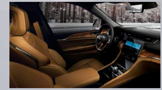
ECT7 - Tupelo Palermo Leathertrim (Option - Customer Order only on Summit Reserve)