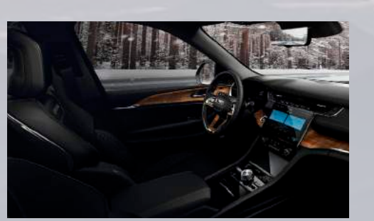
ECX7 - Black Palermo Leather-trim (Standard - Summit Reserve)