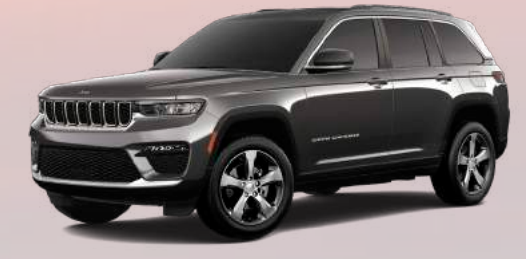
PAS - Baltic Grey (Option)