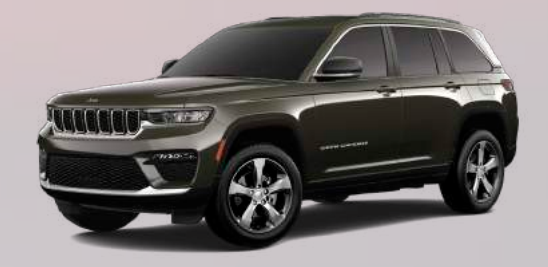
PFJ - Rocky Mountain (Option)