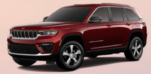
PRV - Velvet Red (Option -Customer Order Only)