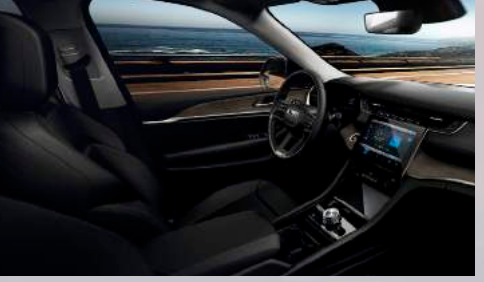
D6X7 - TechnoLeather trim (Standard - Limited)