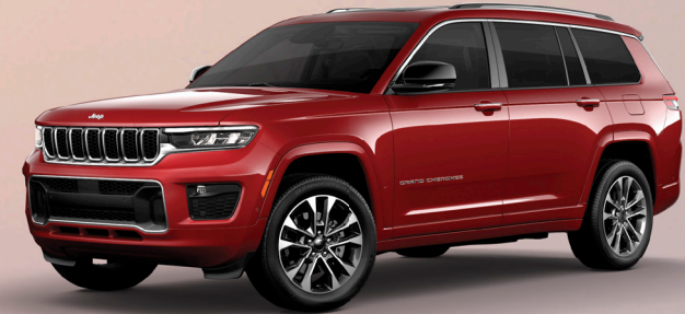
7 seat Overland