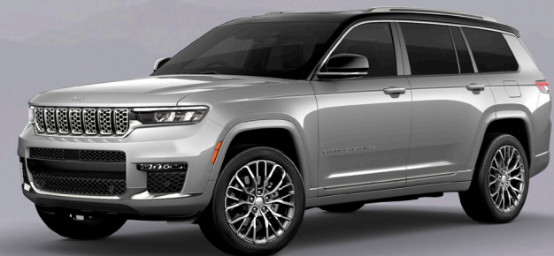
7 seat Summit Reserve