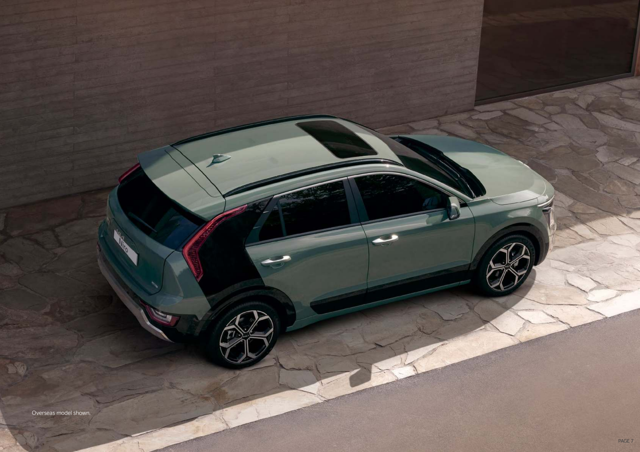
Overseas model shown.