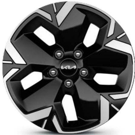
17" ALLOY (EV models)