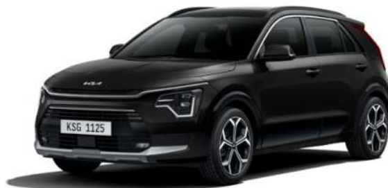
Aurora Black Not available PHEV Light