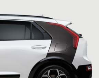
Dark Grey C-Pillar