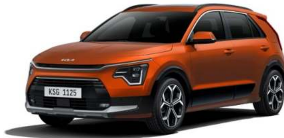
Orange Delight Not available PHEV Light