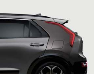
Dark Grey C-Pillar