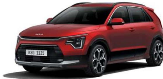
Runway Red Not available PHEV Light