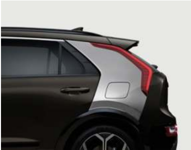
Light Grey C-Pillar