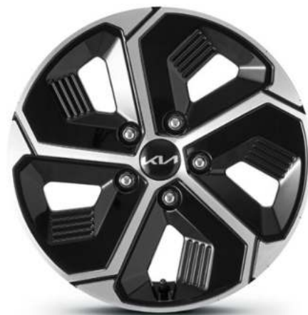
16" ALLOY (Light & Earth models)