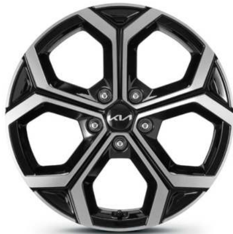
18" ALLOY (Water & GT-Line models)