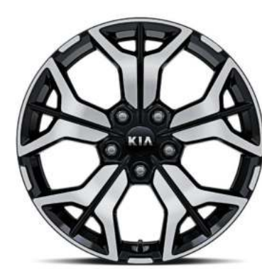
17" Alloy (EX)