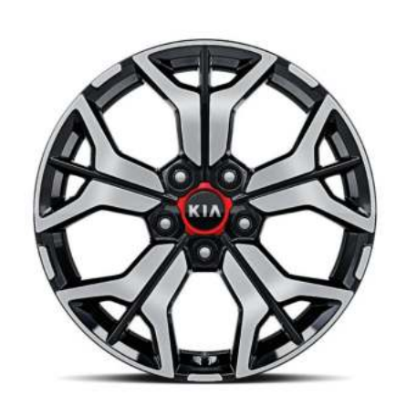
18" Alloy (Limited & Limited AWD)

Two-tone colours are available at additional cost.