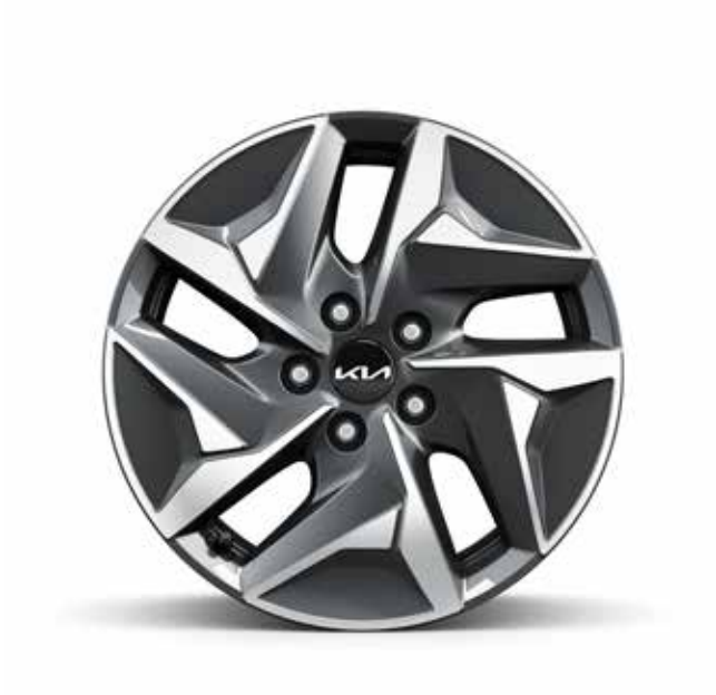
17" ALLOY HYBRID 2WD EX HYBRID AWD EX