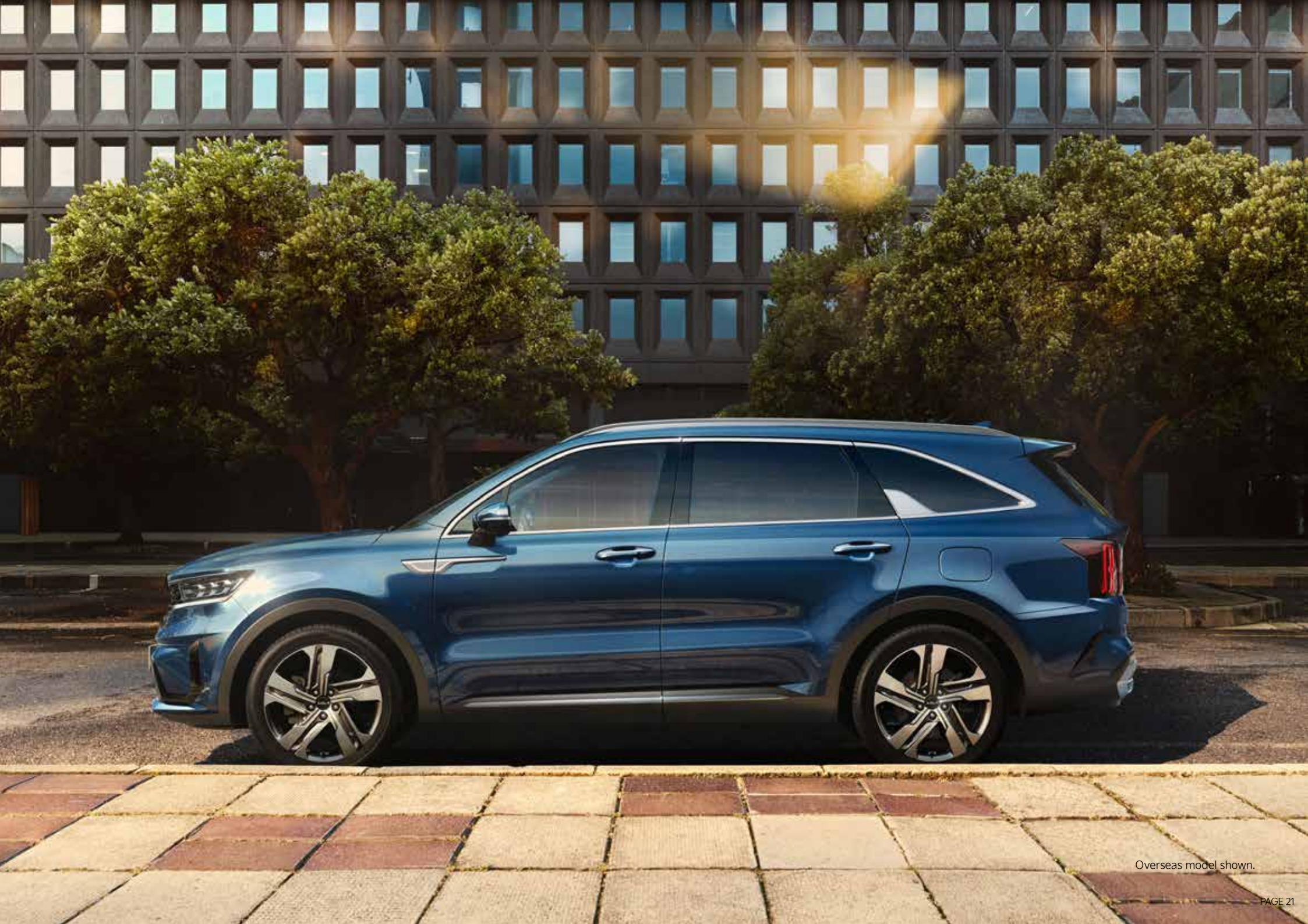
Overseas model shown.