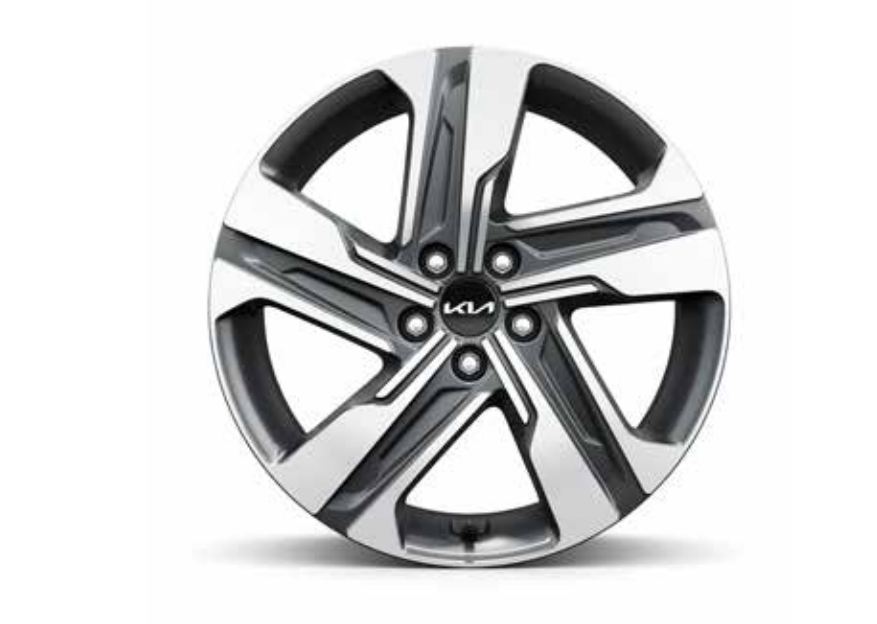
19" ALLOY HYBRID 2WD PREMIUM HYBRID AWD PREMIUM PLUG-IN HYBRID AWD EX PLUG-IN HYBRID AWD PREMIUM