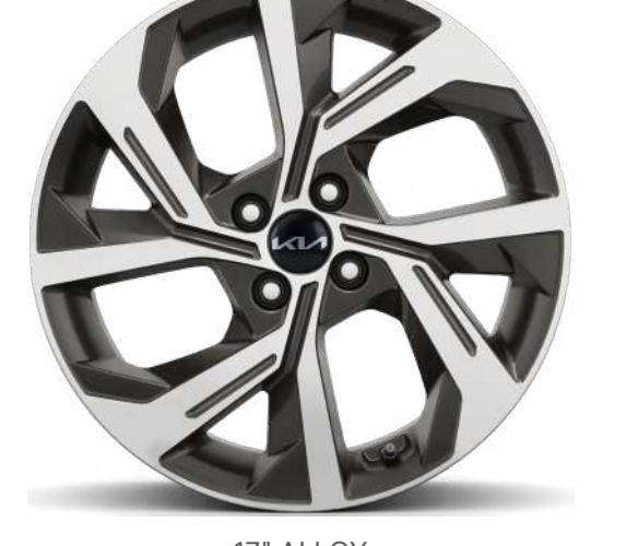
17" ALLOY (LX-T, GT Line & GT Line Plus)