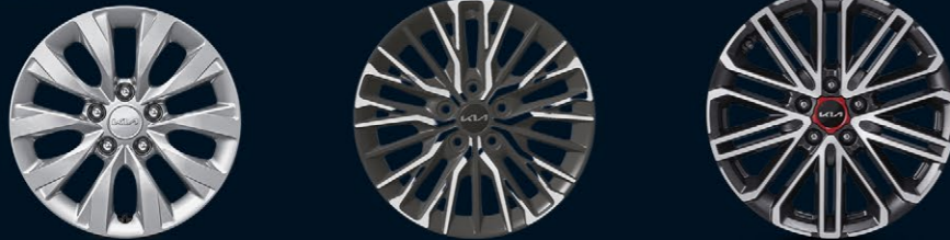
16" Steel (S) 17" Alloy (Sport & Sport+) 18" Alloy (GT)