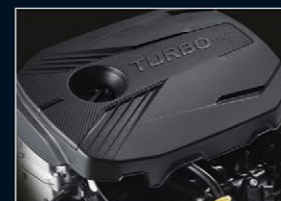
150KW 1.6L T-GDI Petrol (GT)