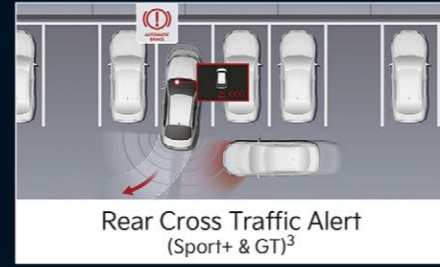
Rear Cross Traffic Alert (Sport+ & GT) 3