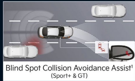
Blind Spot Collision Avoidance Assist 1 (Sport+ & GT)