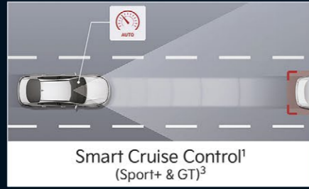
Smart Cruise Control 1 (Sport+ & GT) 3