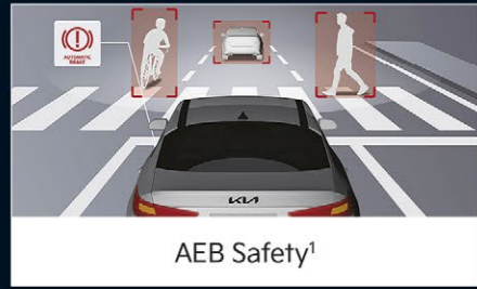
AEB Safety 1