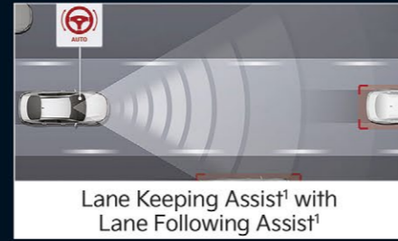
Lane Keeping Assist 1 with Lane Following Assist 1