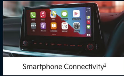
Smartphone Connectivity 2