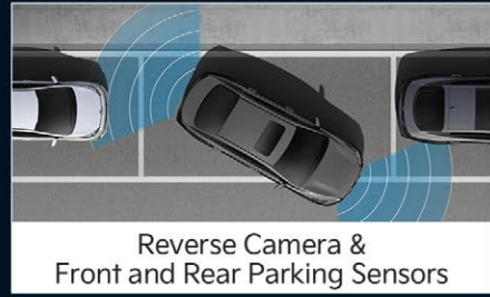
Reverse Camera & Front and Rear Parking Sensors