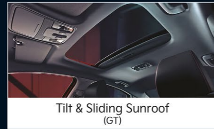
Tilt & Sliding Sunroof (GT)