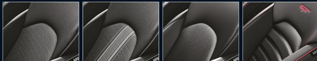
Black Cloth seats (S) Black Cloth seats (Sport) Black Leather Appointed 5 seats (Sport+) Sports Leather Appointed 5 seats (GT)