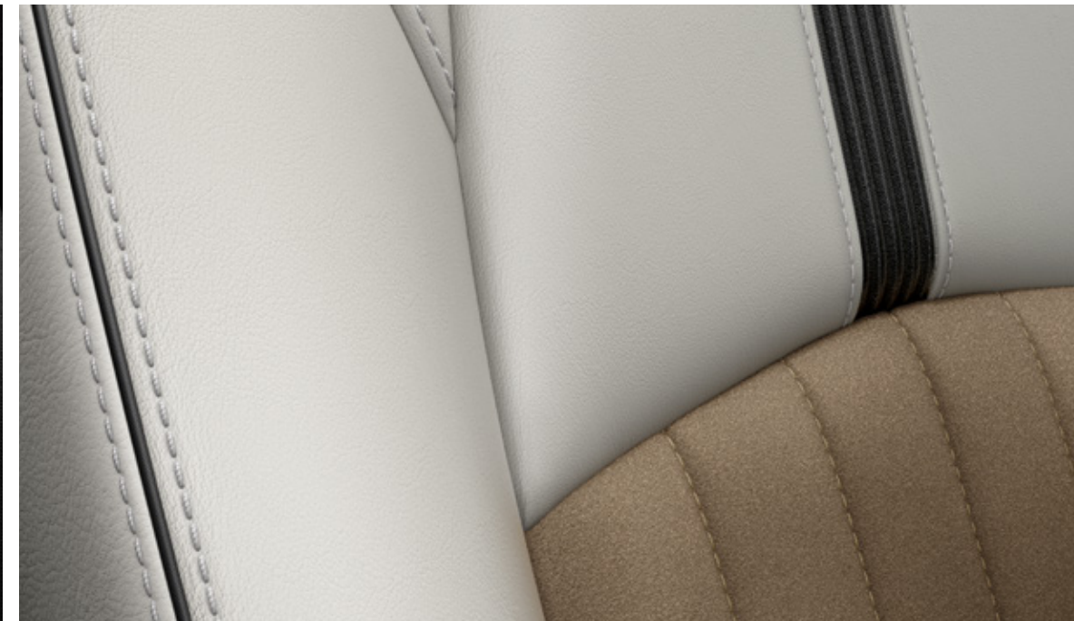
White Maztex and Tan Grand Luxe~ Synthetic Suede (G20 Evolve)