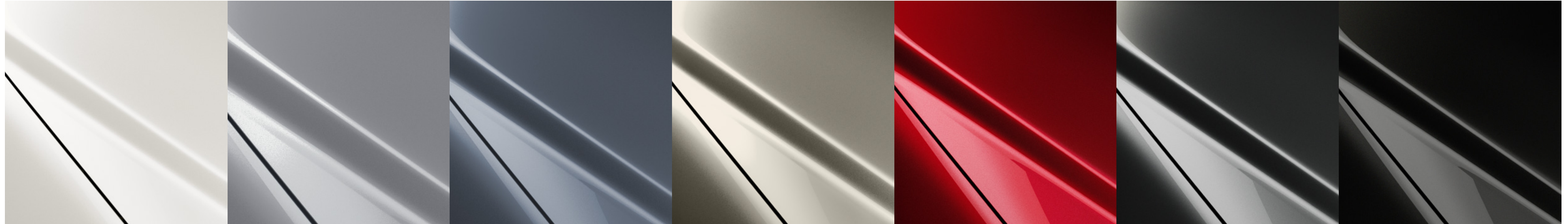
Snowflake White Pearl Mica