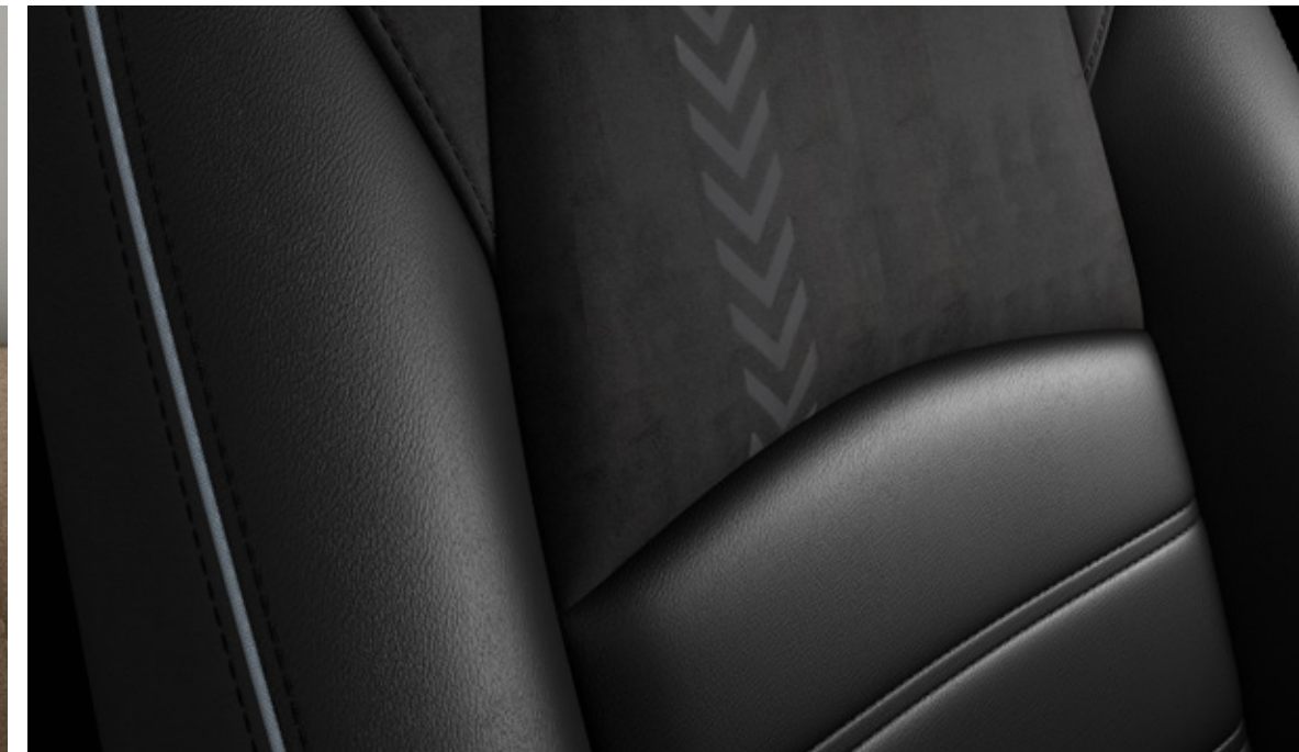
Black Leather and Grey Grand Luxe ~ Synthetic Suede (G20 Touring SP)