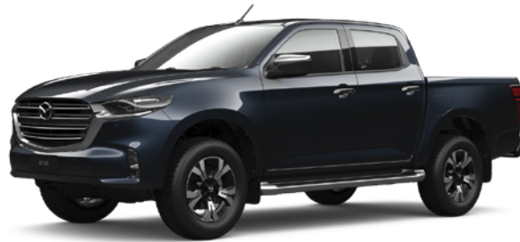
Limited 4WD Wellside