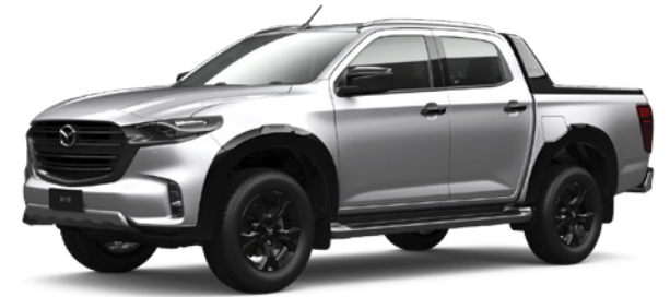
Takami 4WD Wellside