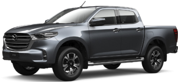
GTX 4WD Wellside