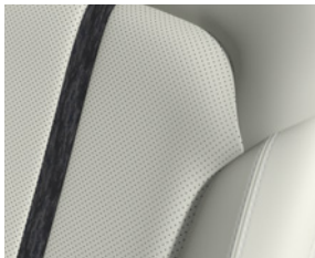
Nappa Leather, Pure White Takami