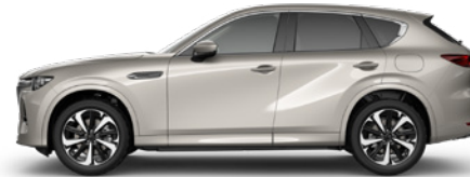
Platinum Quartz Metallic (47S)