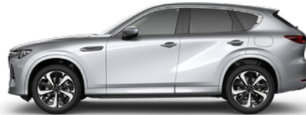
Sonic Silver Metallic (45P)