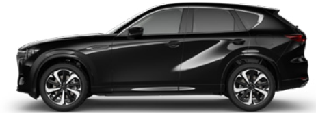
Jet Black Mica (41W)