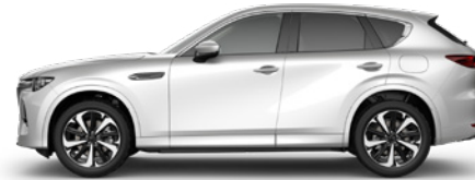
Rhodium White Metallic (51K)