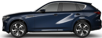
Deep Crystal Blue Mica (42M)