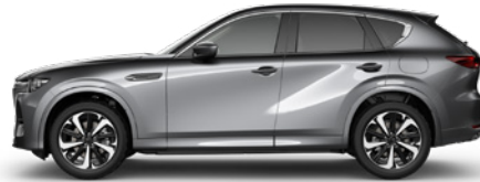
Machine Grey Metallic (46G)