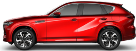
Soul Red Crystal Metallic (46V)