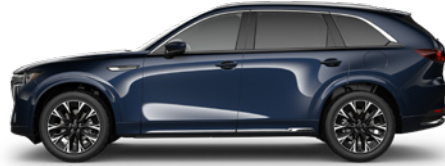
Deep Crystal Blue Mica (42M)