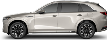
Platinum Quartz Metallic (47S)