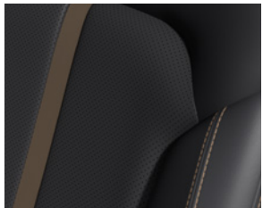
Nappa Leather, Black Takami