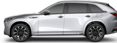
Sonic Silver Metallic (45P)