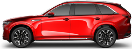
Soul Red Crystal Metallic (46V)