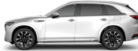
Rhodium White Metallic (51K)