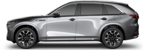
Machine Grey Metallic (46G)