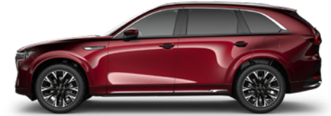
Artisan Red Metallic (51F)