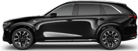
Jet Black Mica (41W)