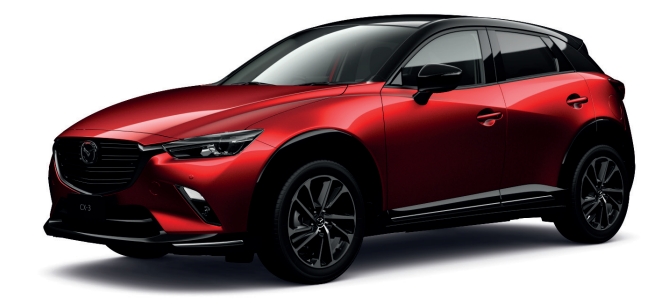
SP20 SKYACTIV-G 2.0 Front-Wheel Drive