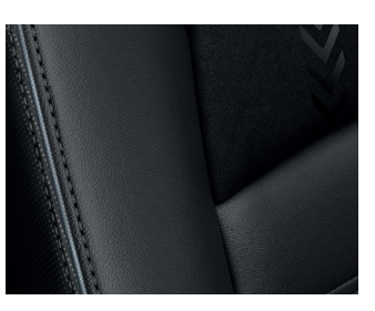
Leather/Suede, Black SP20

*These body colours available with Brilliant Black roof (SP20 only).