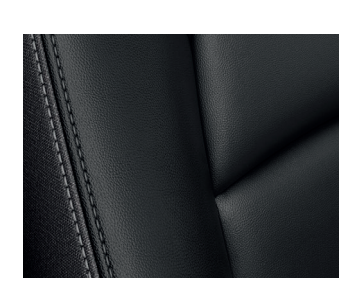
Leatherette/Cloth, Black GSX