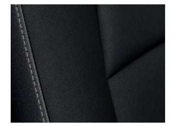
Cloth, Black GLX