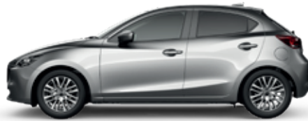
Aluminium Metallic (38P)