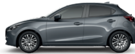
Polymetal Grey Metallic (47C)