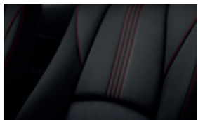
Sport Cloth, Black with red trim GSX