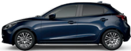
Deep Crystal Blue Mica (42M)