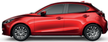
Soul Red Crystal Metallic (46V)