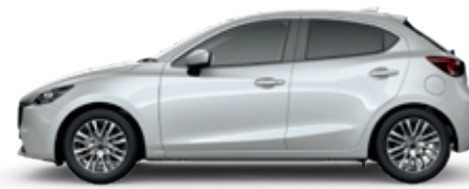
Snowflake White Pearl Mica (25D)