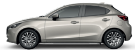
Platinum Quartz Metallic (47S)