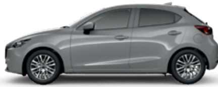
Aero Grey Metallic (52C)