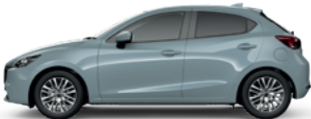
Air Stream Blue Metallic (52L)