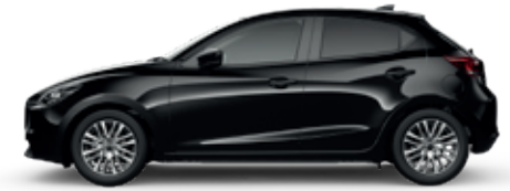
Jet Black Mica (41W)