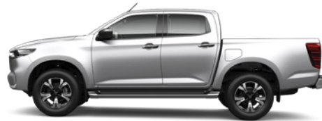
Ignit Silver Metallic (47N)