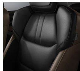
Leather, Khaki with black suede Takami