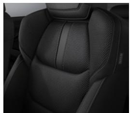
Cloth, Black GSX, GTX