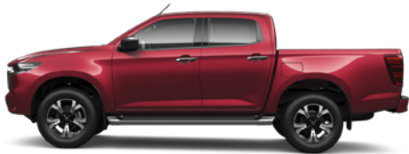
Red Volcano Mica (47F)