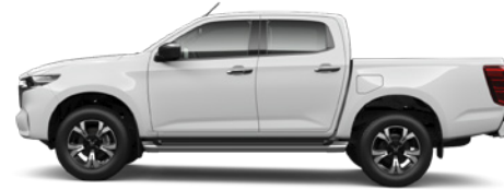
Ice White (A7Y)