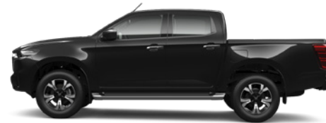
True Black Mica (47R)