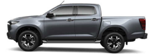
Rock Grey Mica (47H)