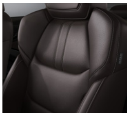
Leather, Brown Limited