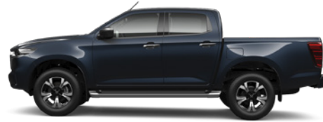
Gun Blue Mica (47J)