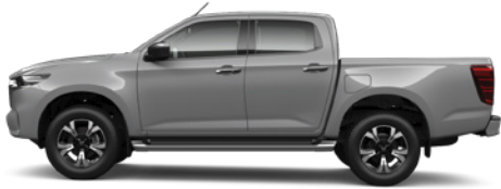
Concrete Grey Mica (47M)