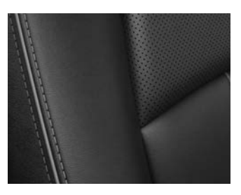
Leather, Black GSX Leather, Limited