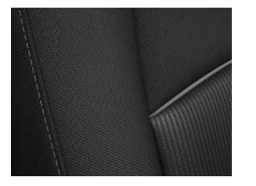
Cloth, Black GLX