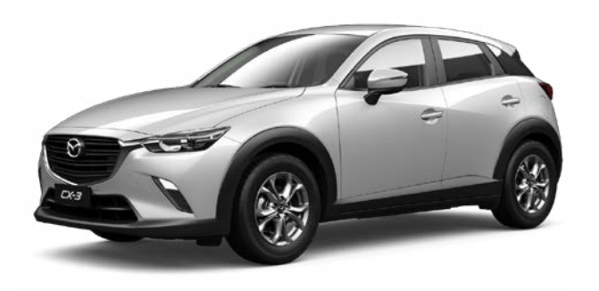
GLX SKYACTIV-G 2.0 Front-Wheel Drive