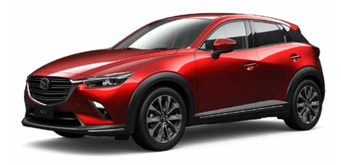
GSX Leather SKYACTIV-G 2.0 Front-Wheel Drive