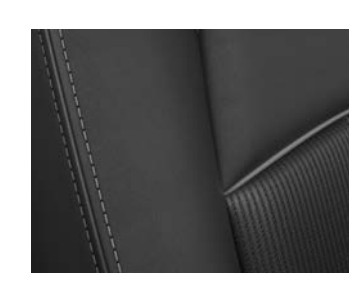
Leatherette / Cloth, Black GSX