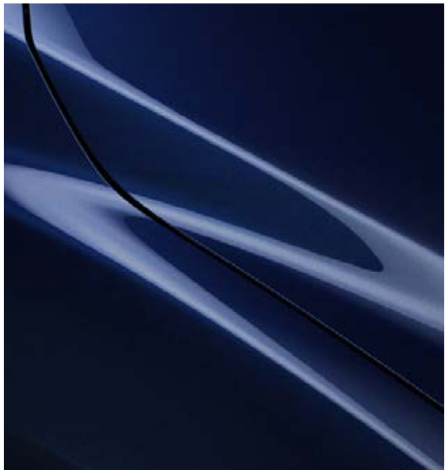
Deep Crystal Blue Mica