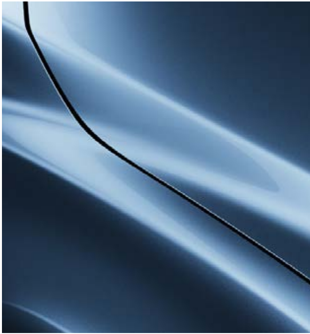
Eternal Blue Mica