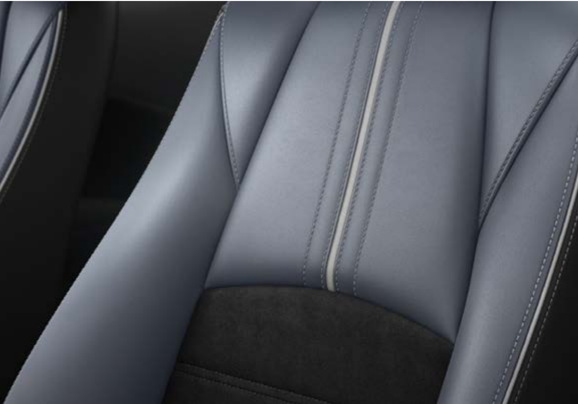
Blue Grey Leather# with Black Grand Luxe®^ Synthetic Suede (Limited)