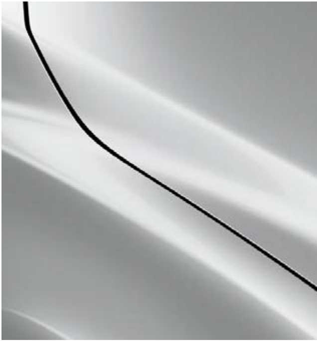
Sonic Silver Metallic