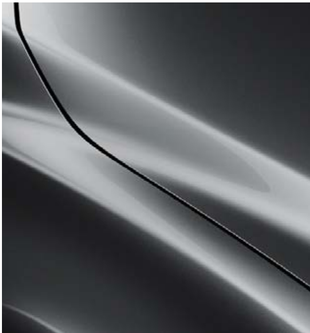
Machine Grey Metallic^

Fusing the hard appearance of metal with a glossy smoothness, the newly developed Polymetal Grey Metallic comes exclusive to the hatch and changes colour depending on the light, accentuating beautiful lines of bodywork.