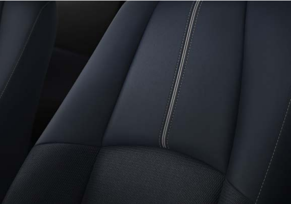
Black / Navy Cloth (GSX)

To maintain the feeling of considered design throughout the cabin, luxurious materials from the seats adorn the door trims and centre dashboard. Beautiful to touch and to admire, these trims create a stylish, fresh ambience that speaks to New Mazda2's modern styling.