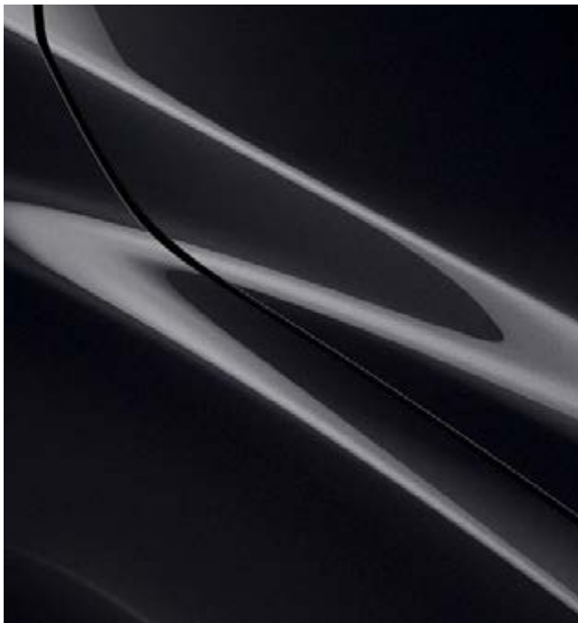
Jet Black Mica