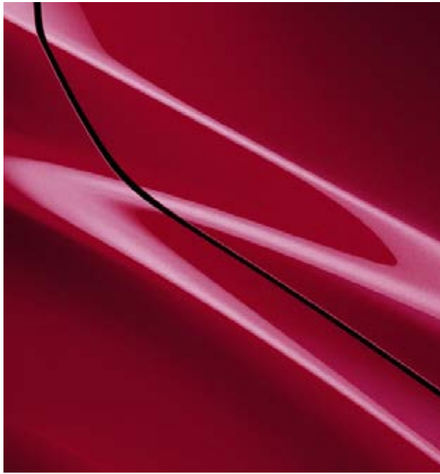
Soul Red Crystal Metallic^