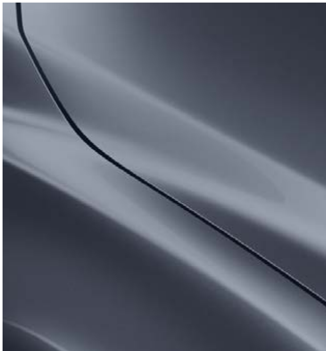
Polymetal Grey Metallic