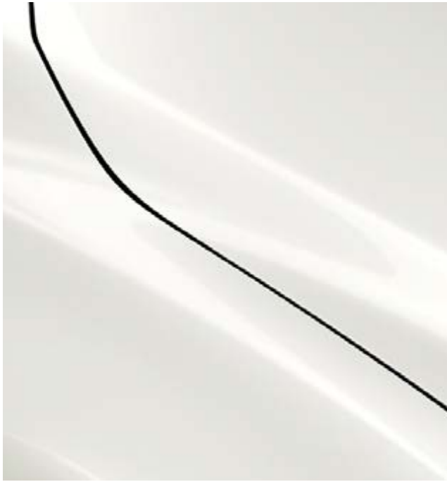
Snowflake White Pearl Mica