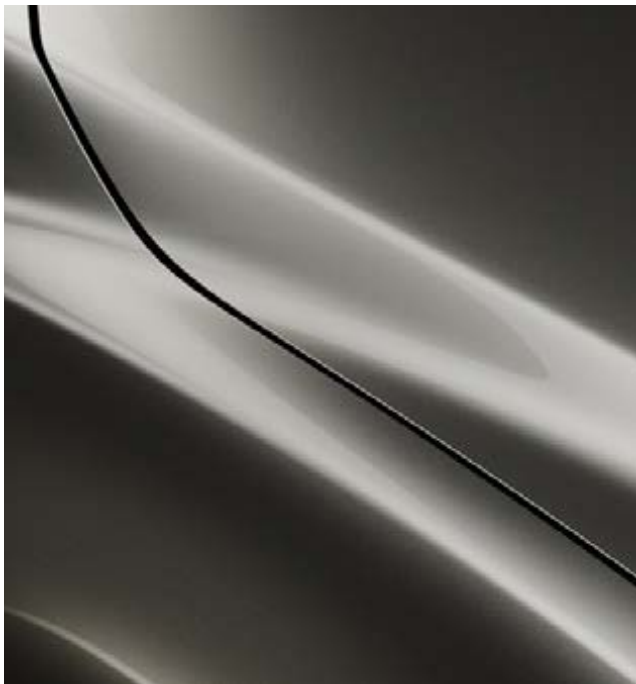
Titanium Flash Mica