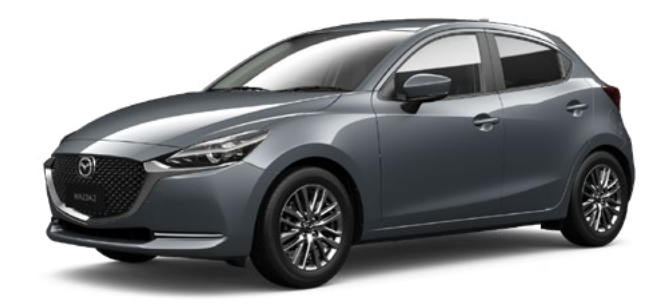
Limited SKYACTIV-G 1.5 Front-Wheel Drive