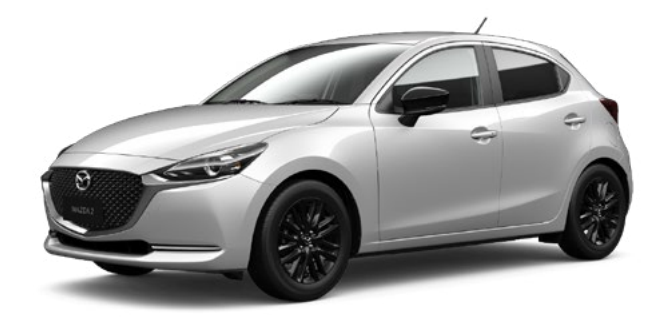
SP15 SKYACTIV-G 1.5 Front-Wheel Drive