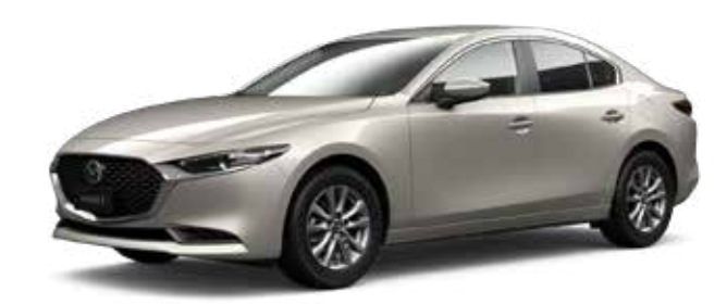
GSX SKYACTIV-G 2.0 Front-Wheel Drive