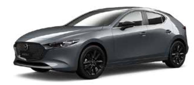
SP20 e-SKYACTIV G 2.0 Front-Wheel Drive