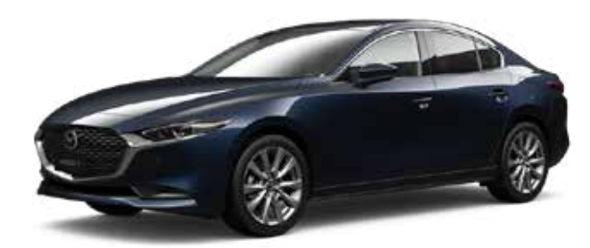
Limited SKYACTIV-G 2.5 Front-Wheel Drive