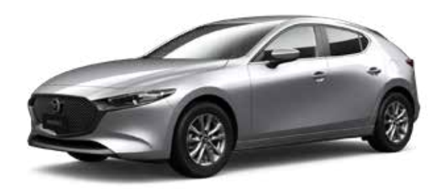
GSX SKYACTIV-G 2.0 Front-Wheel Drive