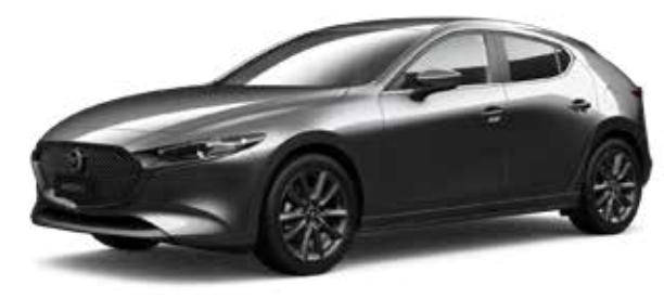
GTX SKYACTIV-G 2.5 Front-Wheel Drive