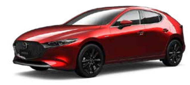
Takami e-SKYACTIV X 2.0 Front-Wheel Drive