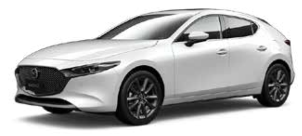
Limited SKYACTIV-G 2.5 Front-Wheel Drive