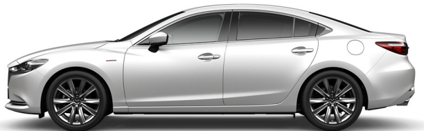
Rhodium White Metallic (51K)