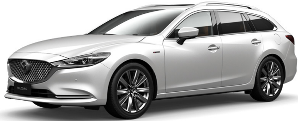
Takami 20 th Anniversary Edition SKYACTIV-G 2.5 T Front-Wheel Drive