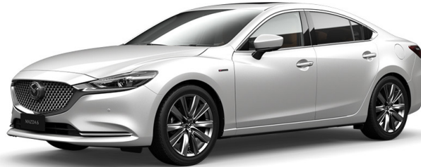
Takami 20 th Anniversary Edition SKYACTIV-G 2.5 T Front-Wheel Drive