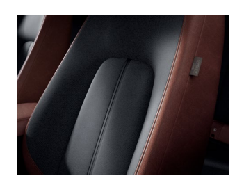
Vintage Brown Leatherette with Black Cloth Limited, Takami