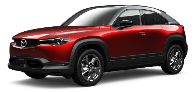
Limited e-SKYACTIV G 2.0