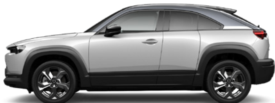
Ceramic Metallic 3-tone (48A)