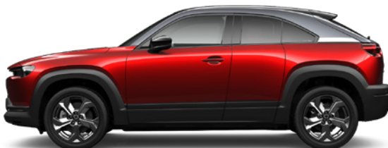
Soul Red Crystal Metallic 3-tone (47E)