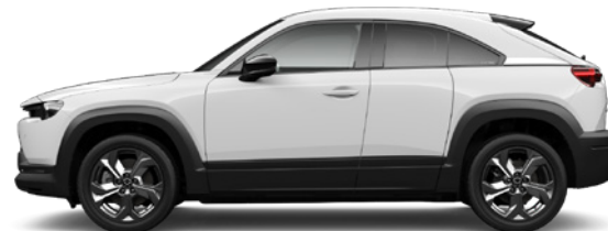
Arctic White (A4D)