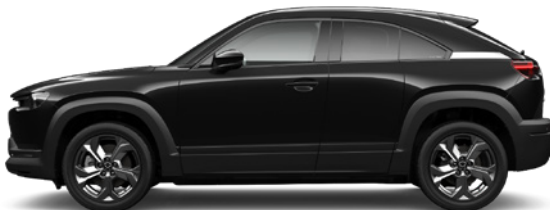
Jet Black Mica (41W)