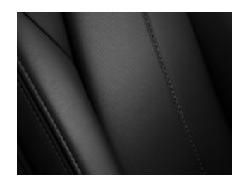
Leather, Black Roadster GT, RF Limited