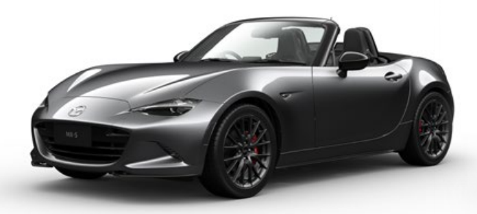
Roadster GT SKYACTIV-G 2.0 Rear-Wheel Drive