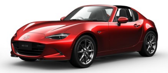
RF Limited SKYACTIV-G 2.0 Rear-Wheel Drive