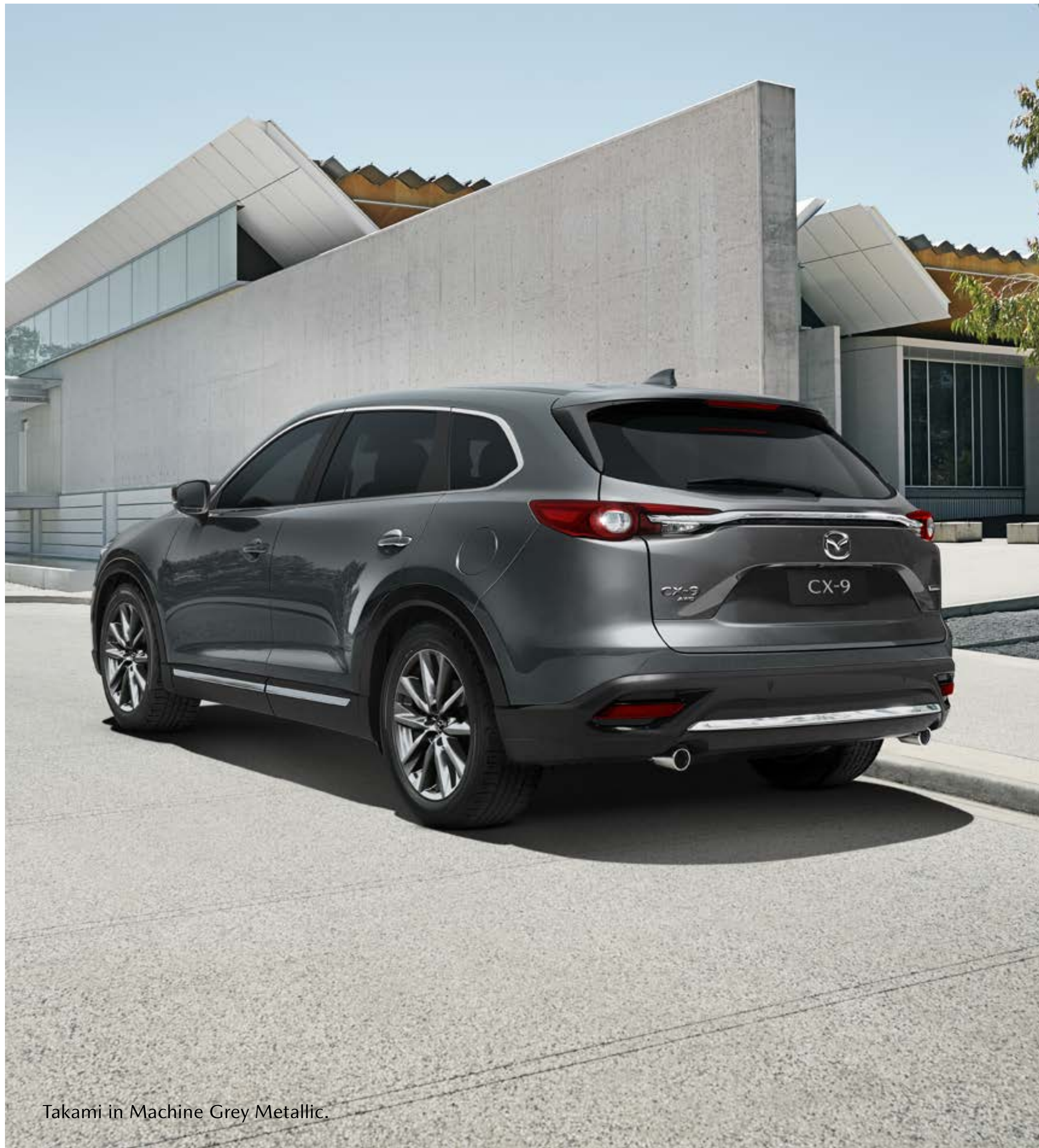
Takami in Machine Grey Metallic.