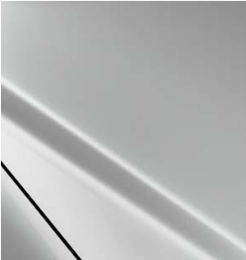
Sonic Silver Metallic