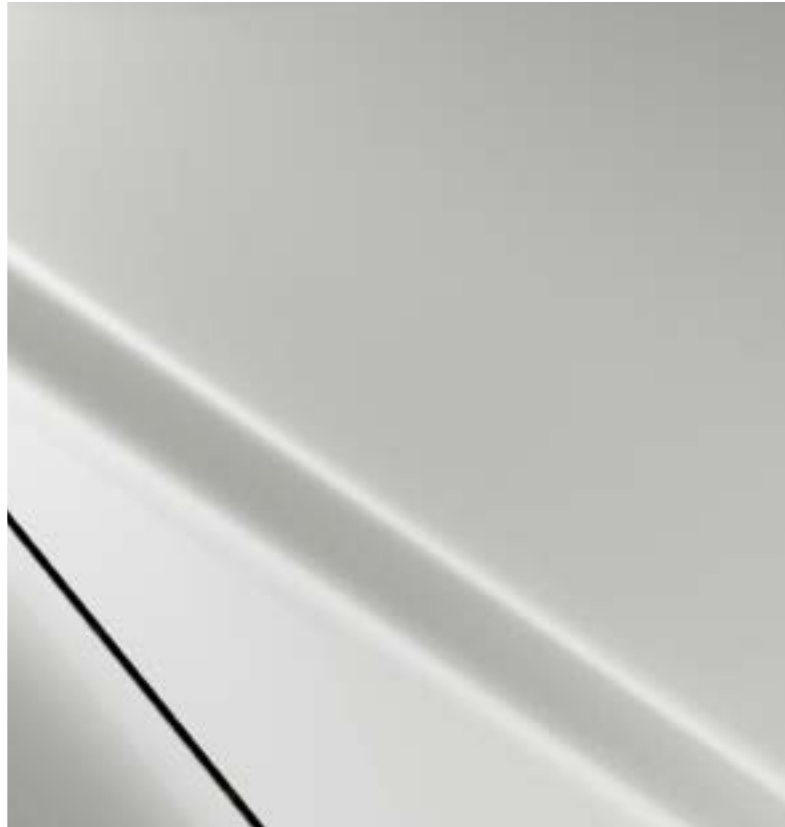
Snowflake White Pearl Mica