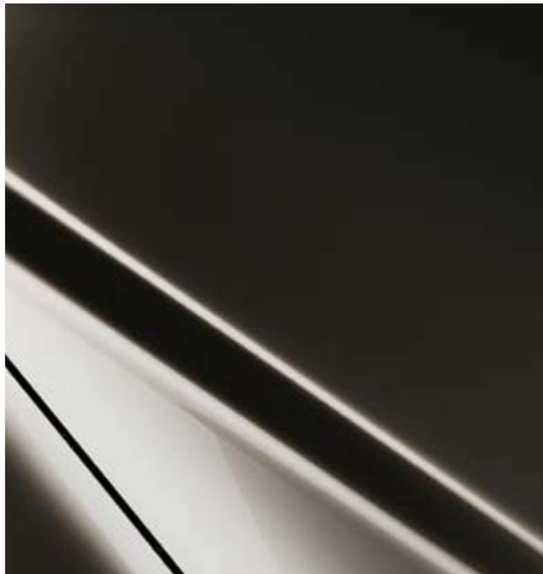
Titanium Flash Mica

Take your pick from the range of colours – all beautifully matched to the bold exterior lines of Mazda CX-9.