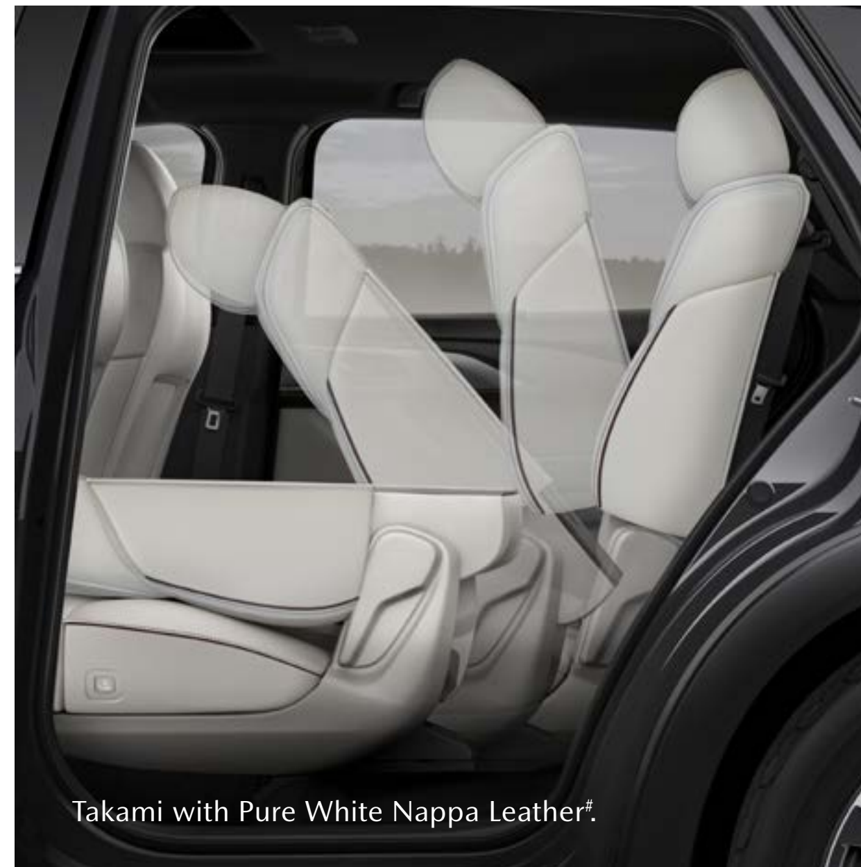
Takami with Pure White Nappa Leather # .