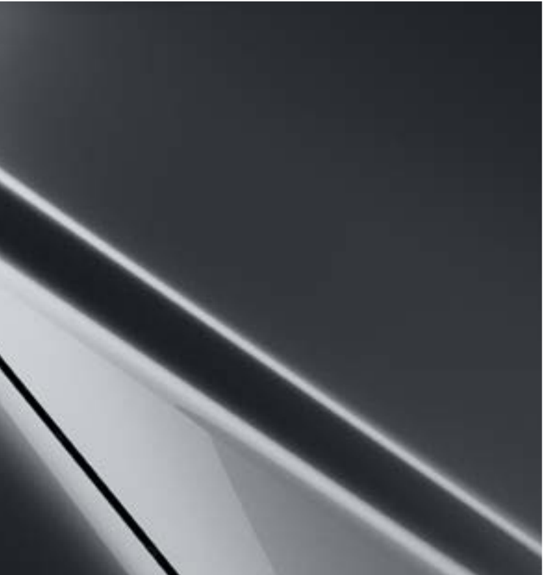
Machine Grey Metallic ^

Take your pick from the range of colours – all beautifully matched to the bold exterior lines of Mazda CX-9.