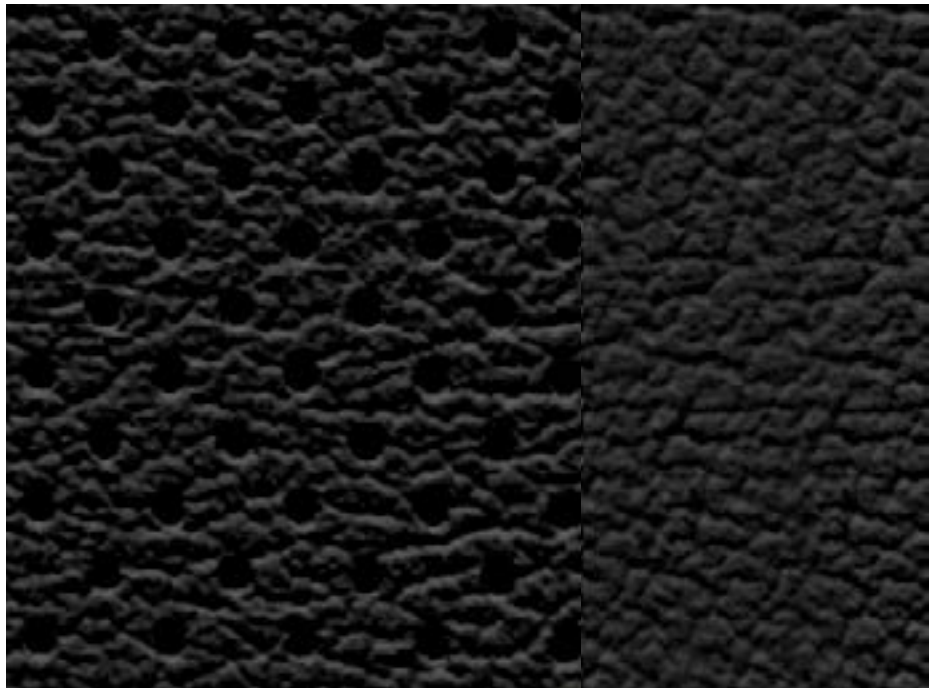
Black Leather# (GSX, Limited)