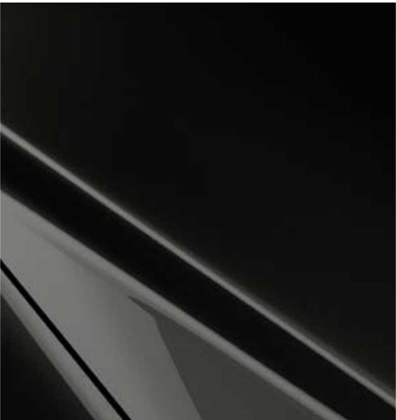
Jet Black Mica