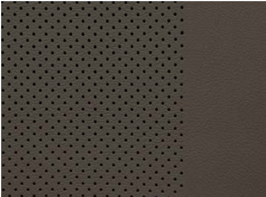
Walnut Brown Nappa Leather# (Takami)