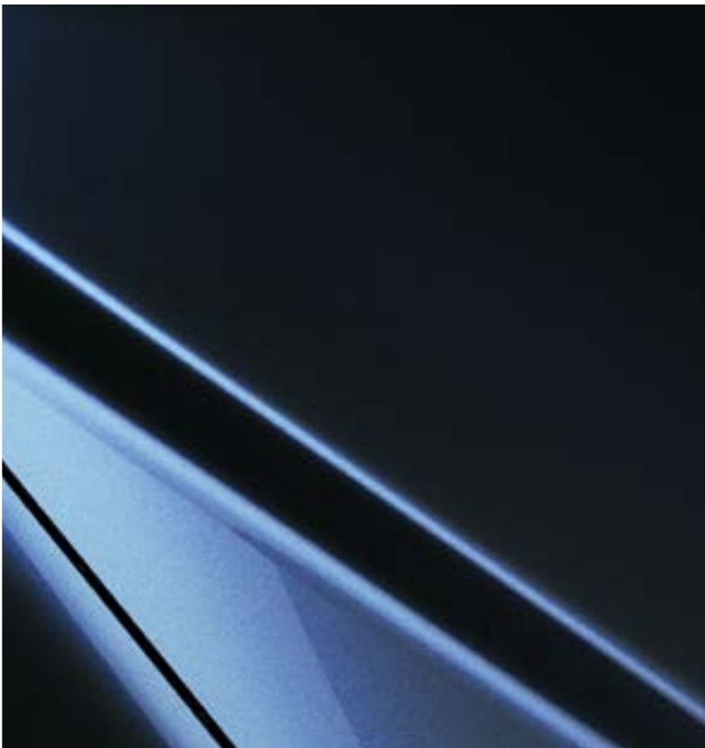
Deep Crystal Blue Mica