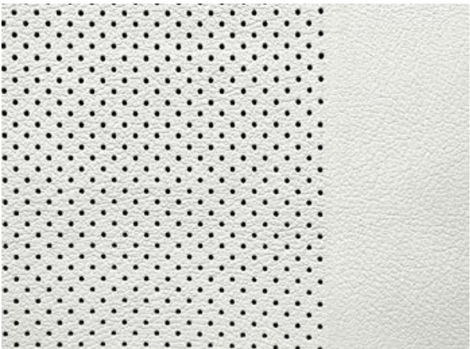
Pure White Nappa Leather# (Takami)