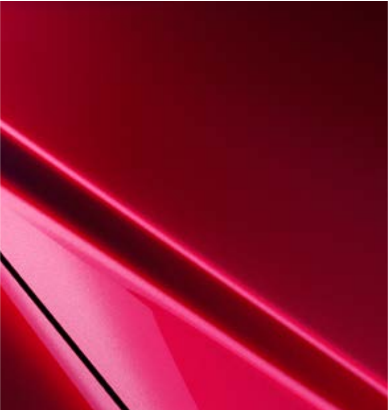
Soul Red Crystal Metallic ^