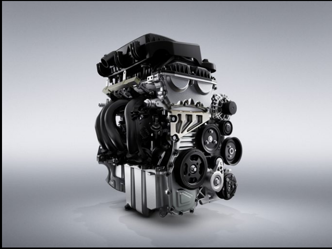
84kW 1.5L NSE Major