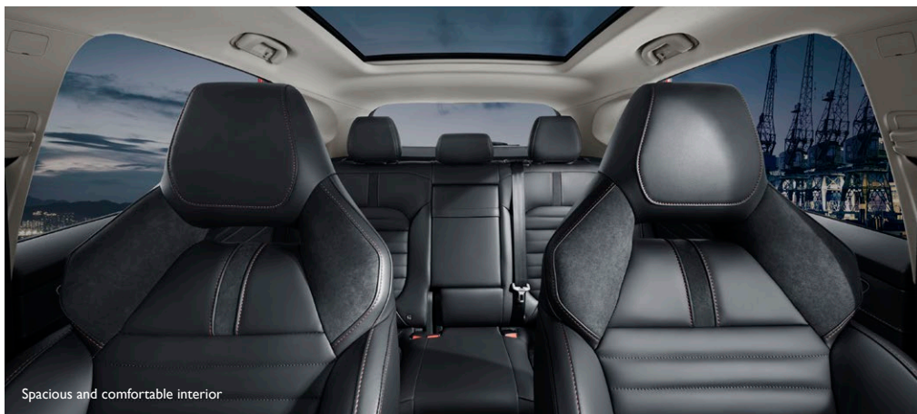
Spacious and comfortable interior