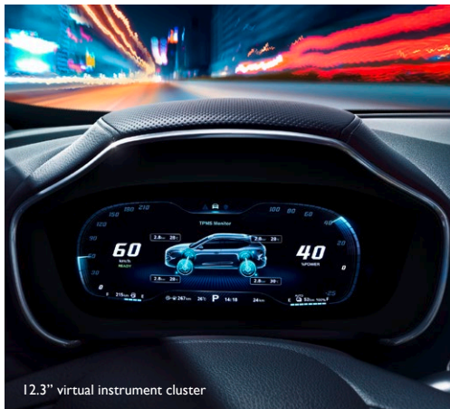
12.3" virtual instrument cluster