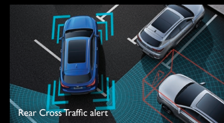
Rear Cross Traffic alert