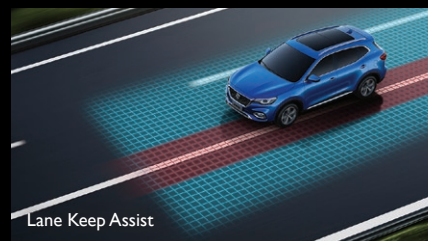
Lane Keep Assist