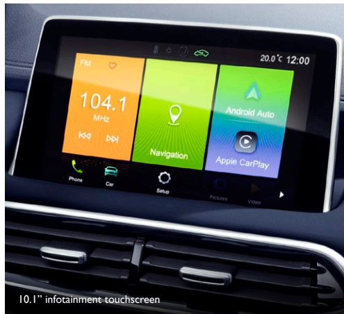
10.1" infotainment touchscreen