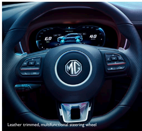
Leather trimmed, multifunctional steering wheel