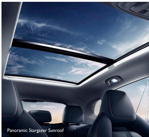
Panoramic Stargazer Sunroof