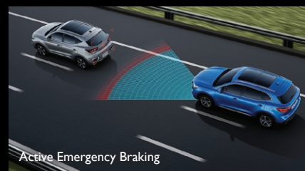
Active Emergency Braking

With its 10 Active Driver Safety features as standard, MG PILOT is constantly sensing your surroundings, on the lookout for unseen hazards. With the ability to react autonomously in situations where driver safety is at risk, take comfort that you and your family are backed by a new level in safety intelligence. With 6 SRS airbags, the MG HS PHEV offers a new standard in safety.