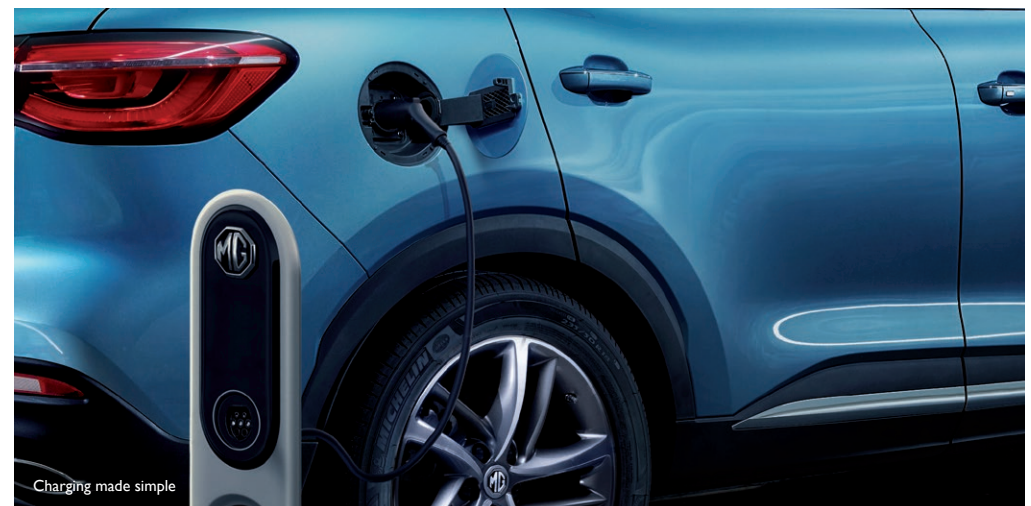
Charging made simple