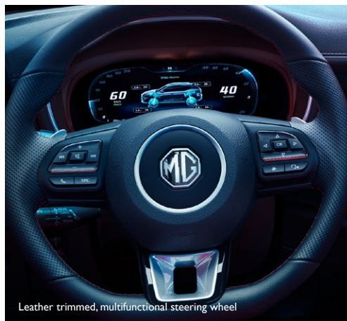
Leather trimmed, multifunctional steering wheel