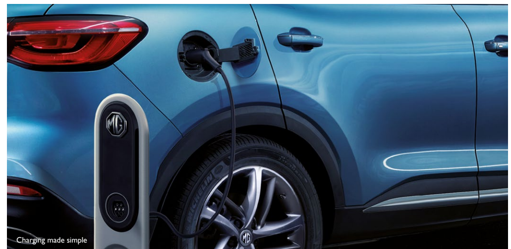
Charging made simple

Actual Australian specification may vary from vehicle shown.