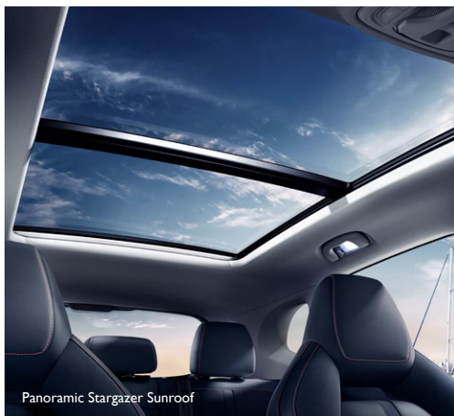
Panoramic Stargazer Sunroof