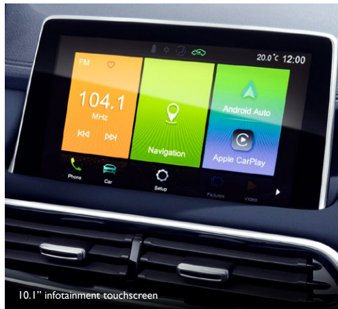
10.1" infotainment touchscreen